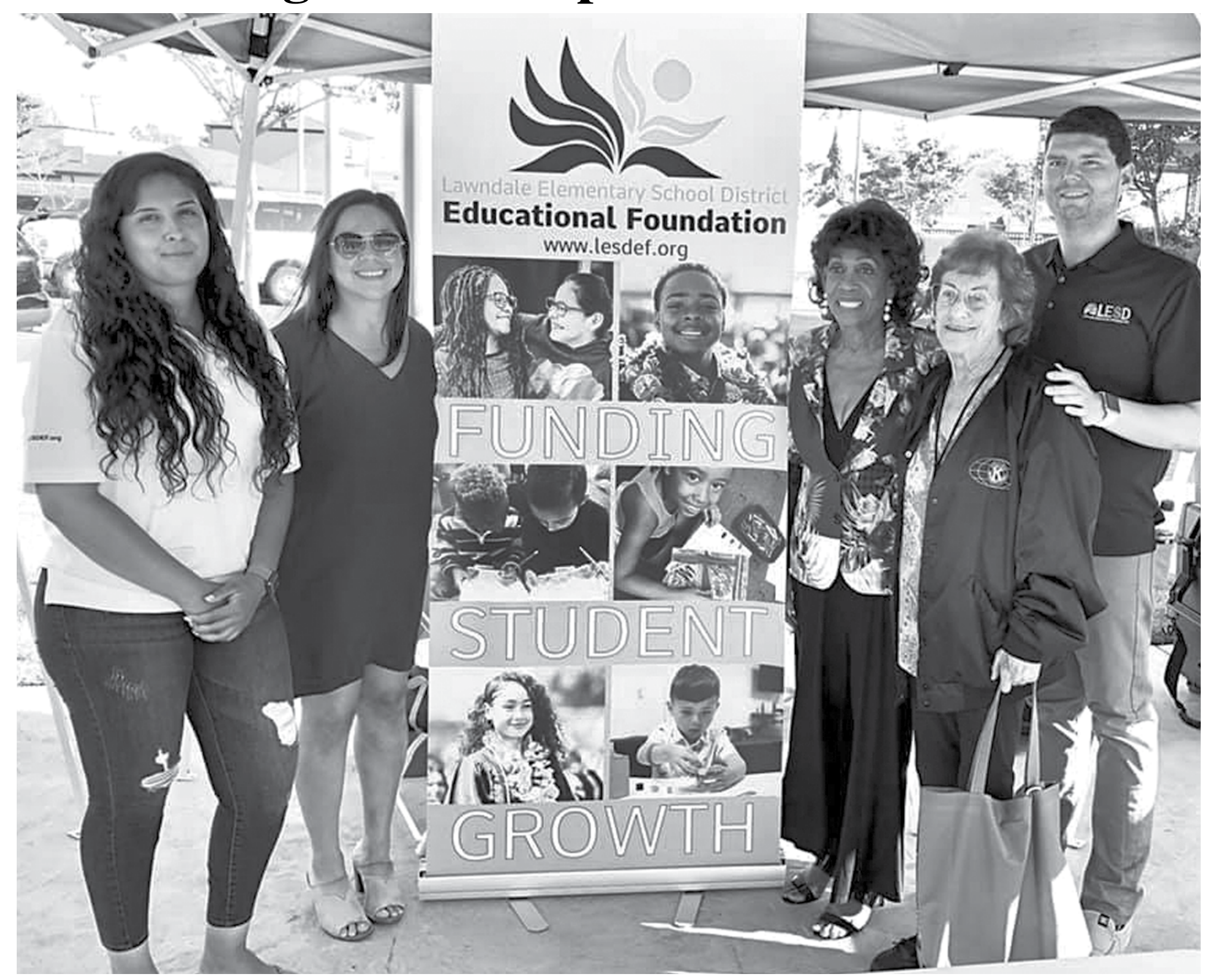
The City of Lawndale's Night Out was the perfect community venue to revive the Lawndale Elementary School District Educational Foundation. The Ed Foundation funds student initiatives such as Makerspaces where students can develop their skills in science, technology, engineering, art, and mathematics (STEAM).