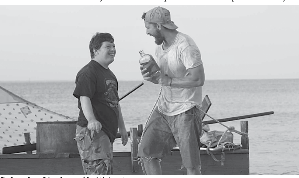
The Peanut Butter Falcon

I write this next statement in full sincerity: The Peanut Butter Falcon plays very much like an after-school special on the importance of friendship. It's essentially the