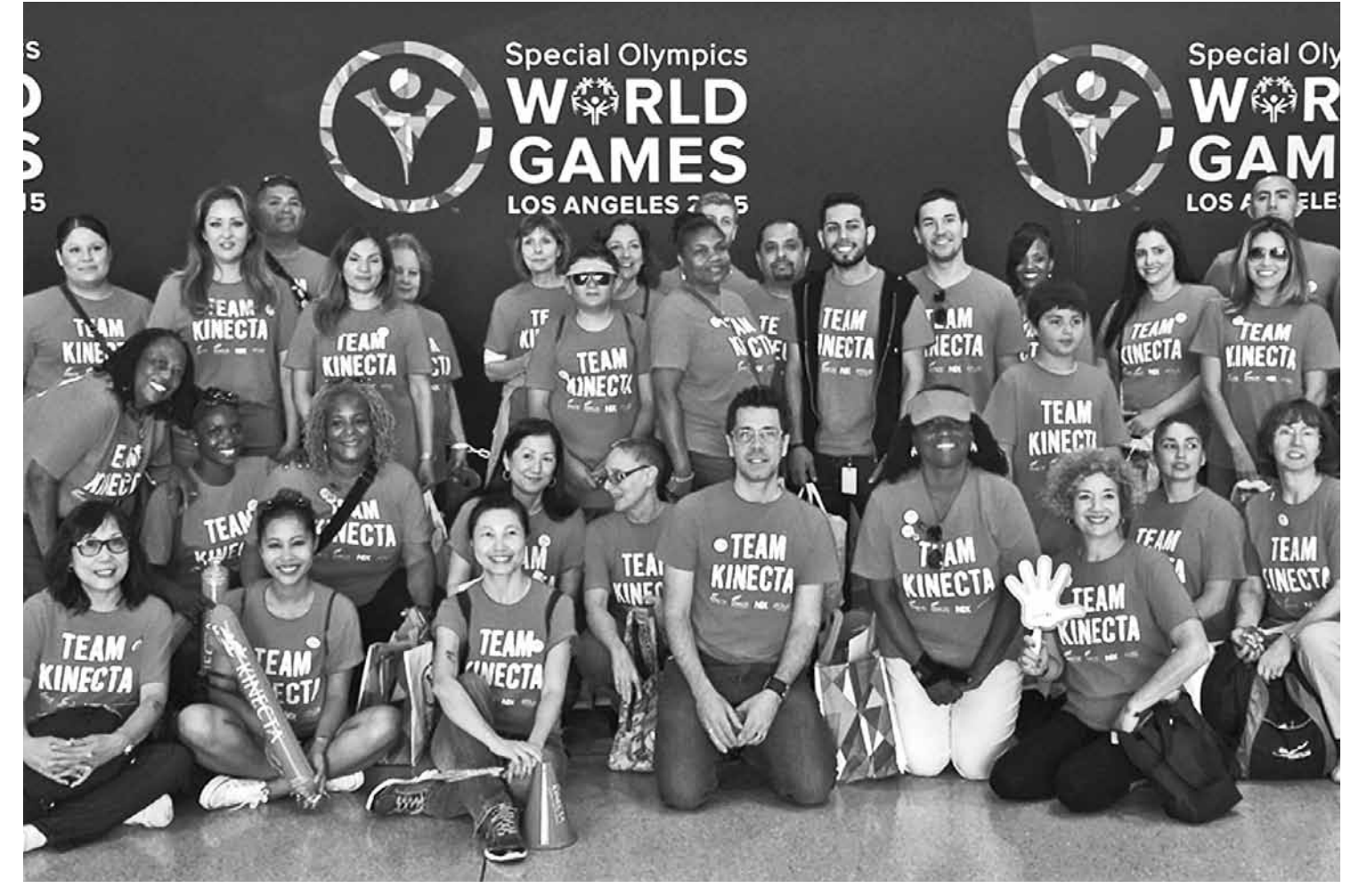
Team Kinecta "Fans in the Stands" participants numbered nearly 70 at the 2015 World Games Special Olympics basketball games held at USC Galen Center, July 28. Kinecta raised money and donated transportation and equipment for the fans to cheer on the athletes.