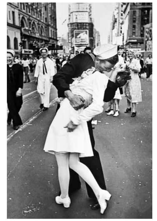
Alfred Eisenstaedt's photo 'V-J Day in Times Square' captured the fervor and passion of the war's end. Many people have come forward claiming to be the sailor or the woman in white: scientists have used astronomy , historical detail, and shadows to help rule out some of those claimants. before that, it is possible to search for photosynthetic biosignatures in the Alpha Centauri B spectrum. Using the proposed polarization technique, this task becomes

The scientists have found that the part of visible light reflected by various plants with vibrant colors oscillates in certain directions, while incident light oscillates in all directions. Thanks to this peculiarity, this reflected light can be detected remotely by using polarizing filters (similar to Polaroid sunglasses or 3D movie goggles) when viewed at specific angles, even if the star is millions of times brighter than the planet. The team found that each biopigment has its own colored footprint in such polarized light. This technique could be instrumental in searching for life in the planetary system nearest to the Sun, Alpha Centauri, with existing telescopes. There are three stars in this system. While scientists are interested in finding life around all these stars, Alpha Centauri B, only 4.37 light-years from Earth, seems optimal for life searches with current telescopes. In 2014, a small planet was discovered around Alpha Centauri B. Unfortunately, this exoplanet is ten times closer to the star than Mercury is to the Sun, so its surface is melting under the stellar heat, and it probably has no atmosphere. At a distance where planets like Earth with liquid water on their surface could exist (the "habitable zone"), no planets have been found as yet, but scientists are continuing to search for one. If such a planet is found, or even