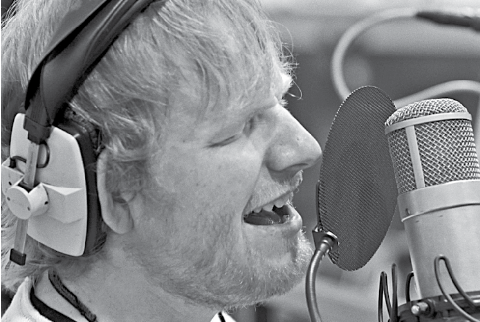
Songwriter