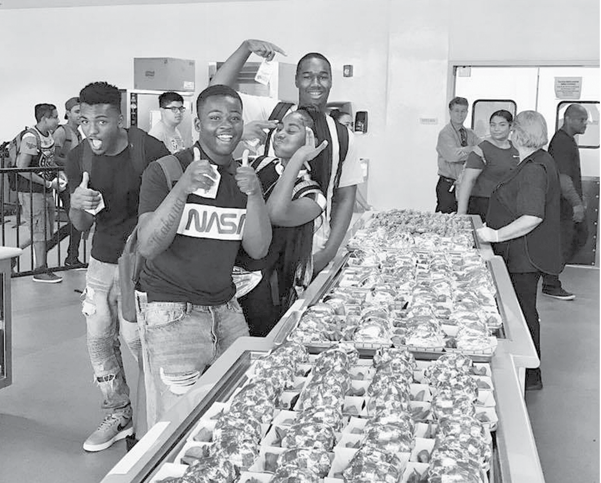
The first week at Leuzinger High School was a huge success. From the food (pictured above in quantities galore) to the spirit rallies to the classroom learning, there were many great things going on.