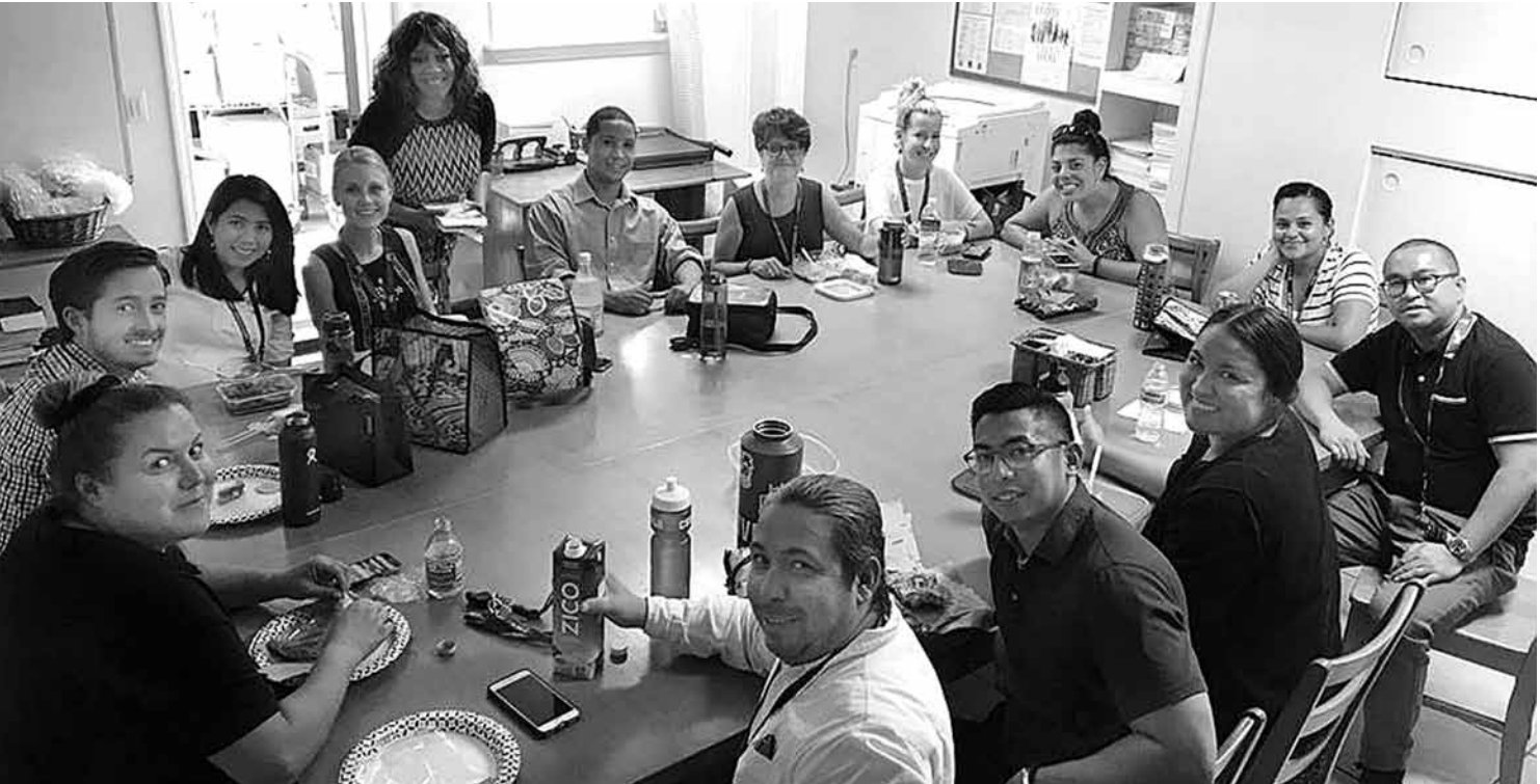
What happened to summer? Just like that, school is in session once again. The photo above shows the fine teachers at Hawthorne's Saint Joseph's School preparing and raring to go for another year.