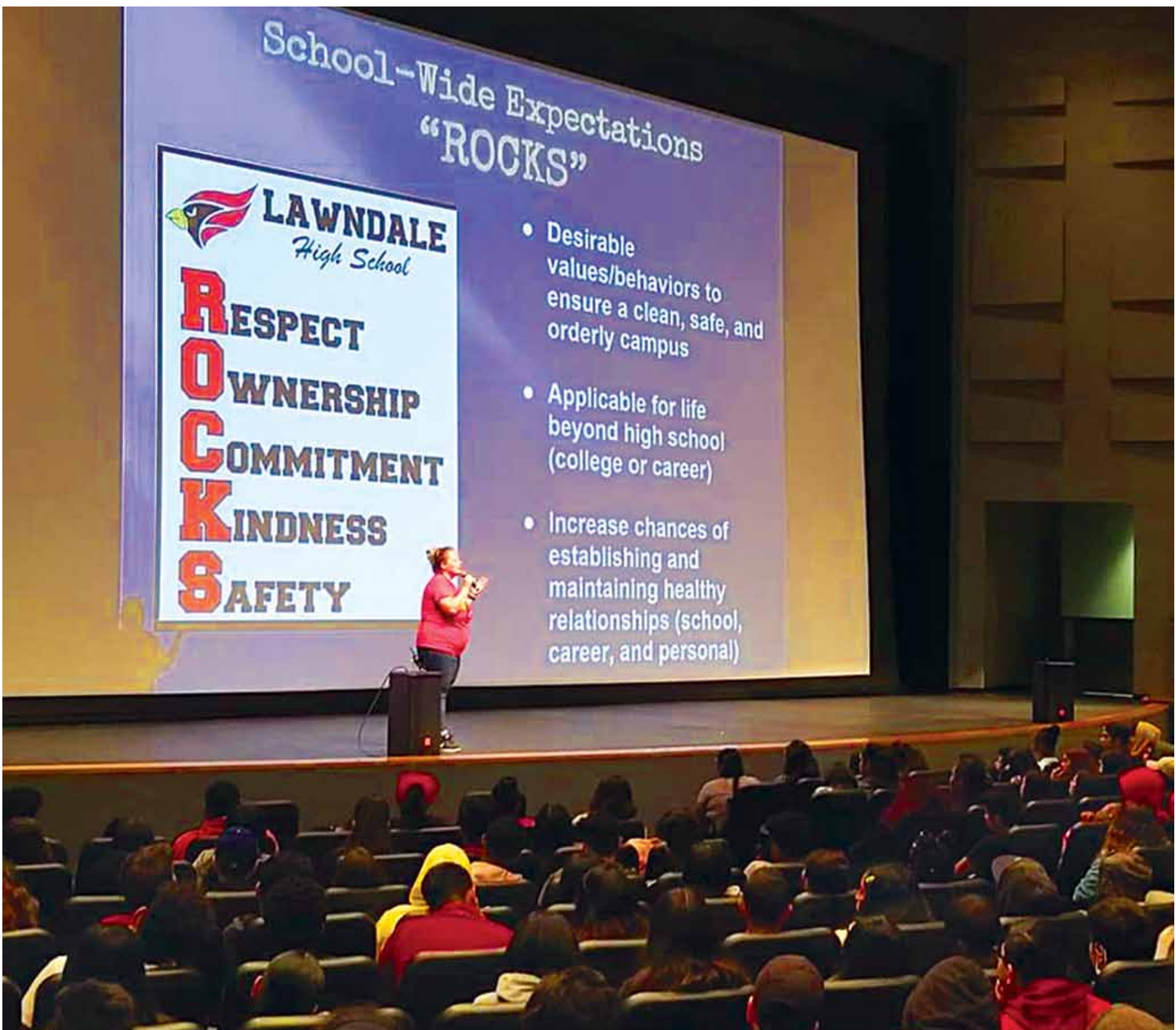
Sharing the ROCKS (Respect, Ownership, Commitment, Kindness, Safety) lifestyle with sophomores at the fall 2018 Success Assembly at Lawndale High School this month.