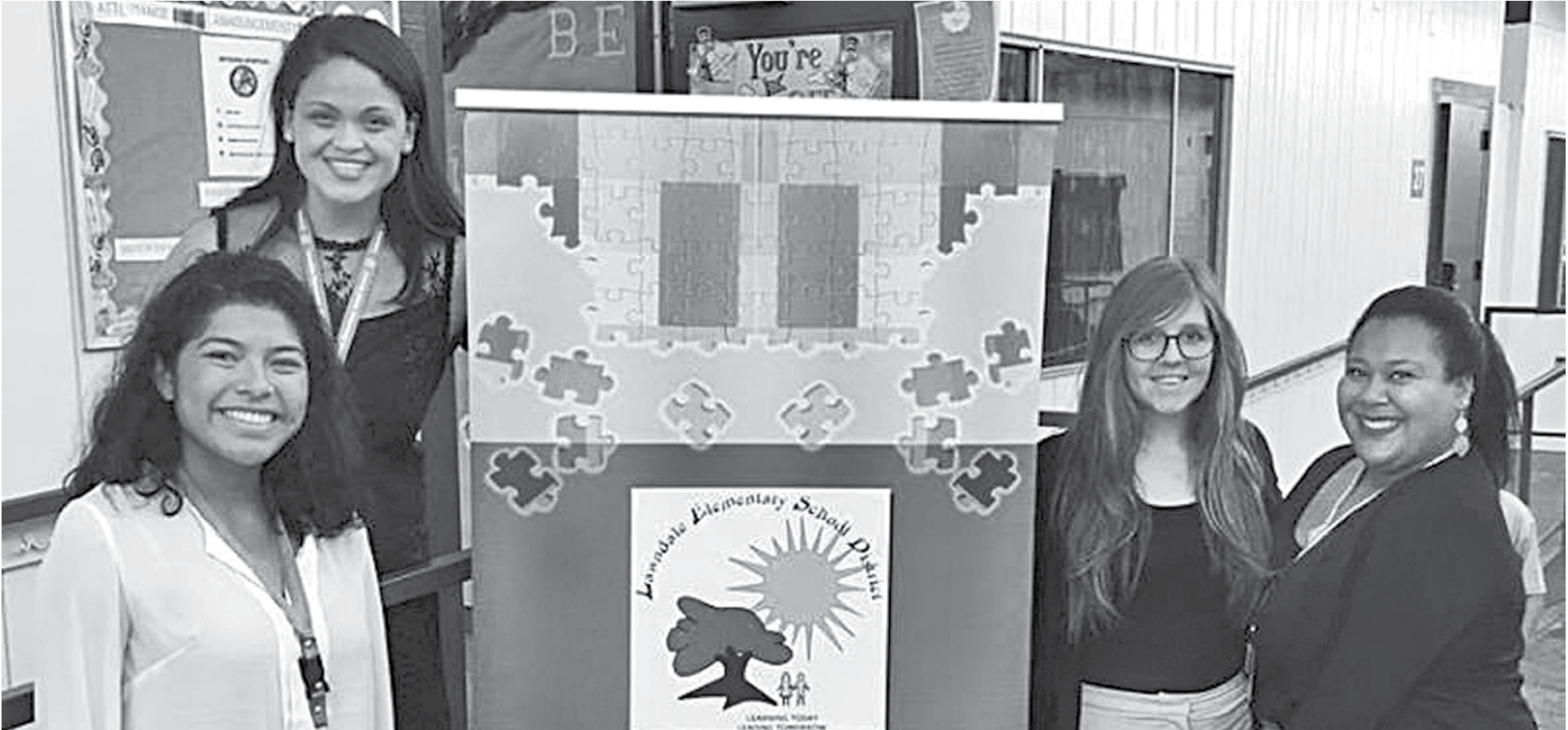
Among those in the house at Back to School Night at Billy Mitchell Elementary School were these awesome Student Support Services Interns.