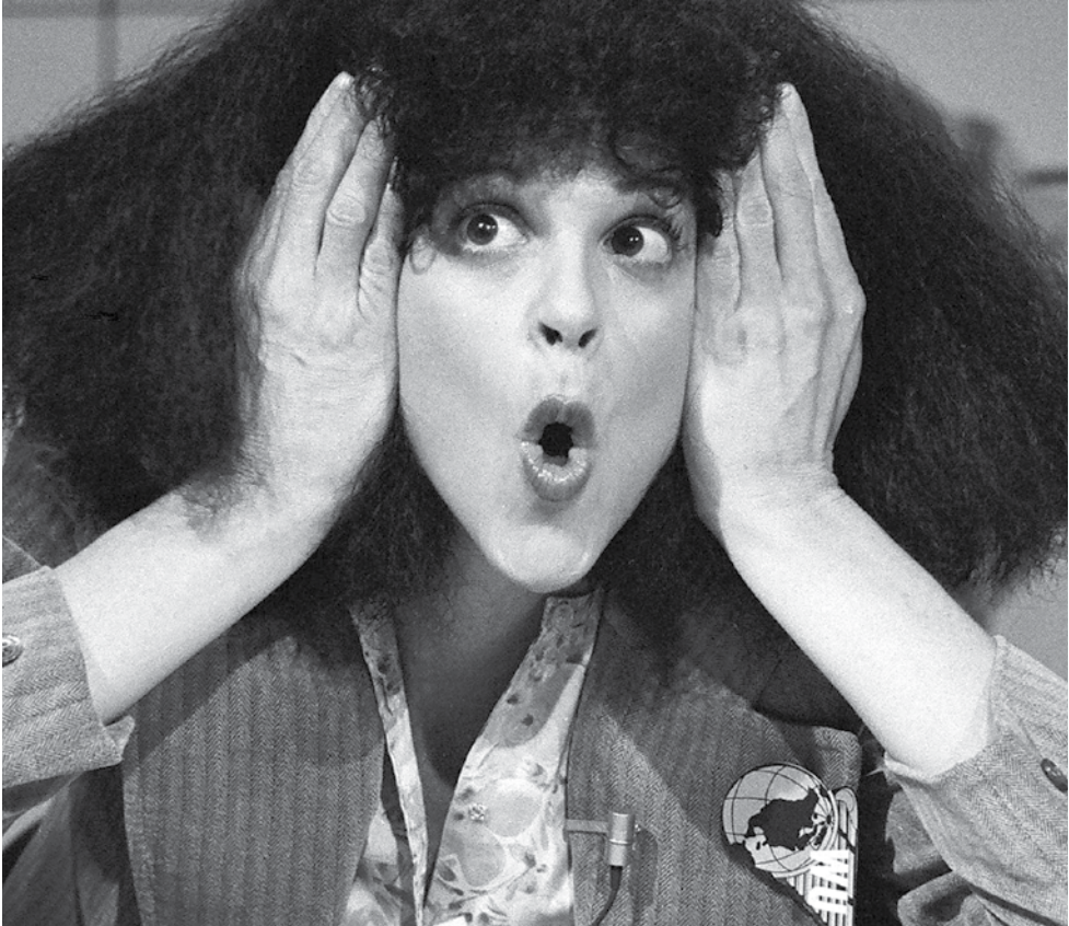
Love, Gilda

to acknowledge her influence on female comedians. Her fearlessness in her performances on SNL paved the way for future women to fight for their airtime, and showed that women are meant to be more than just background or setting. In 1978 Gilda won an Emmy for Outstanding Supporting Actress for SNL, highlighting her