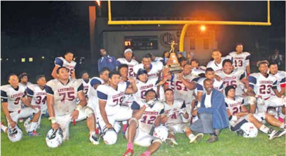
Leuzinger High’s football team won the Mayor’s Cup by downing rival Hawthorne 34-13 in a non-league football game last Friday at Leuzinger.

The Cougars begin the Ocean League at home in another “Battle of the Winless” against another 0-5 squad in Santa Monica. The Vikings, who have a long history of football success, are already off to their worst start since their 0-10 1992 squad after getting blanked by last year’s