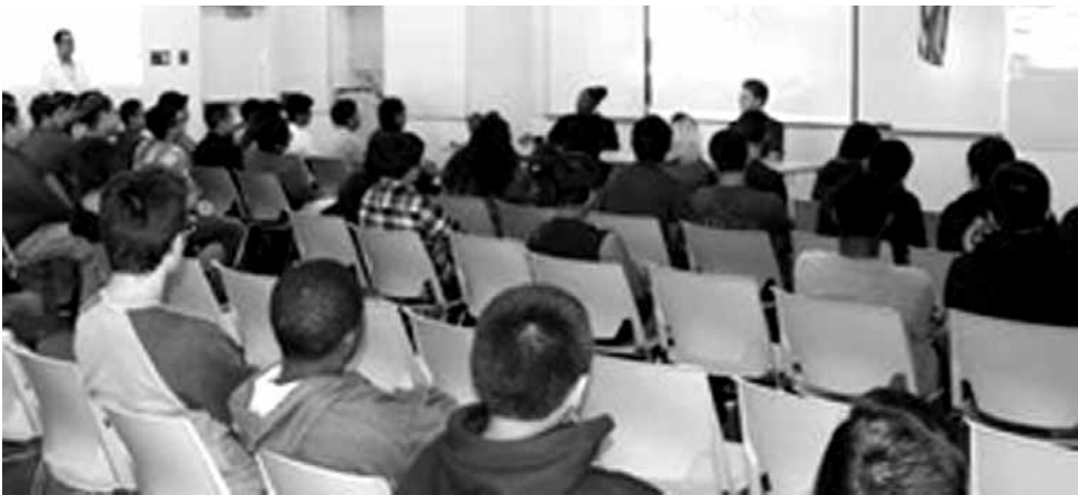
Hawthorne High School students were treated to a special presentation and Q&A session when representatives from the Jet Propulsion Lab (JPL) Speakers Bureau visited the school's Engineering Quad auditorium on Monday, October 5, 2015.

each get opportunities to deliver feisty discourse with Fassbender's Jobs, and each is equally compelling. Since the triptych structure of the film allows for a very clear progression of character's relationships, the arcs are more easily recognizable, but nonetheless well executed. Because of the similarities to predecessor The Social Network , Steve Jobs may not feel as enigmatic or fresh as the former film, but its entertainment and gripping narrative are enough to make it a must-see in its own right. It is firing on all cylinders and captures the man behind so much of today's world in a delectable manner. Because of the conscious decision to not cover the entire lifespan of Steve Jobs, but instead explore a series of dramatic relationships he had, the film is one that can stand beautifully beside Walter Isaacson's book in that it only makes you want to learn more about the man instead of trying to encapsulate everything about him. Few influencers were as complex as Steve Jobs, and he is fortunate to have a film that does justice to the fascinatingly complex individual he is. For the numerous reasons listed above, Steve Jobs , a film equally attributed to Danny Boyle, Aaron Sorkin, and Michael Fassbender, is one of the must-see films of the year. Steve Jobs opens this Friday at the Landmark Theatre. •