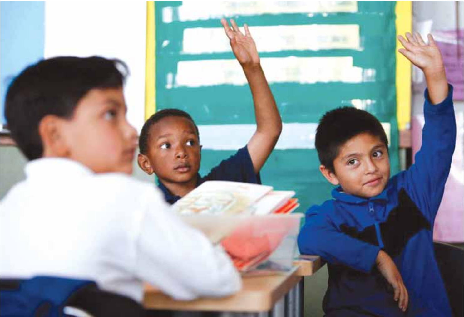
Chevron’s “Fuel Your School” campaign is continuing throughout the South Bay cities. Teachers can post their classroom needs on DonorsChoose.org and Chevron will donate to help fund them. For more information, visit fuelyourschool.com .