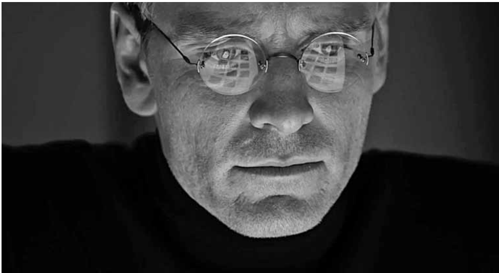
Michael Fassbender in Steve Jobs.

using three different eras of cameras/film to match the progression of technology. Michael Fassbender, easily one of the greatest working actors we have today, tackles the character of Steve Jobs from the immediate get-go. He never feels disguised as the character, but instead embodies the classic approach where he is still very much himself within the spectrum of this incredible character. As is the case with nearly every element of the film, the ensemble of performers all show-up and deliver knockouts. Supporting cast members Kate Winslet, Seth Rogen, Michael Stuhlbarg, and Jeff Daniels