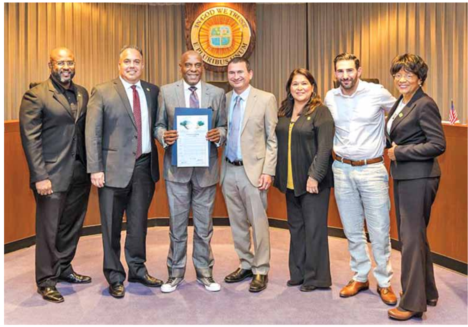
Senator Steven Bradford received a proclamation from the Hawthorne City Council for his outstanding service to the South Bay Community. Senator Bradford gave a legislative briefing on accomplishments of the current year.