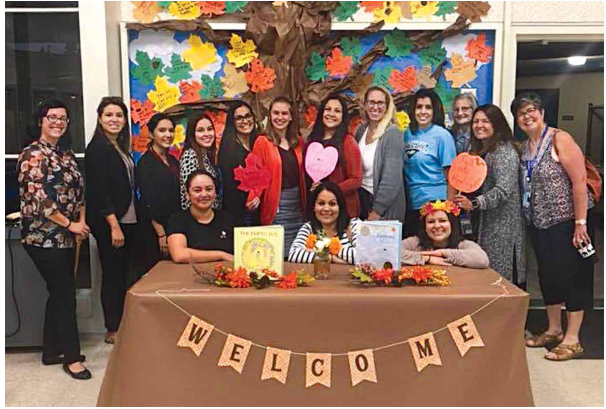
Family Literacy Night was a huge success over at Mark Twain Elementary School last week.