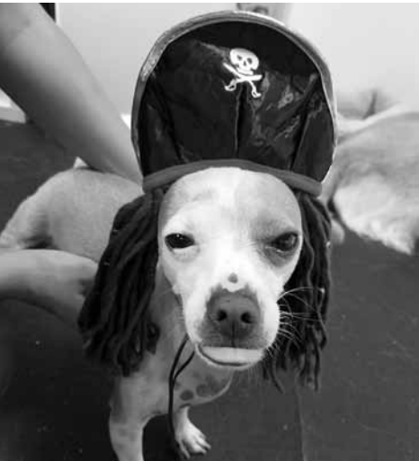
"Ollie" Arrgh!.