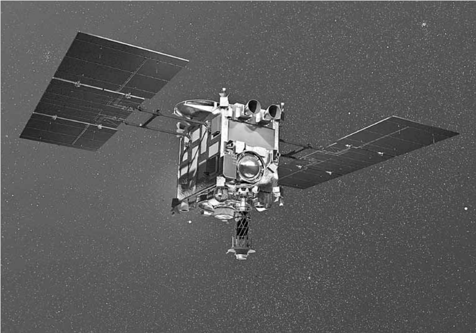
A MASCOT animation still