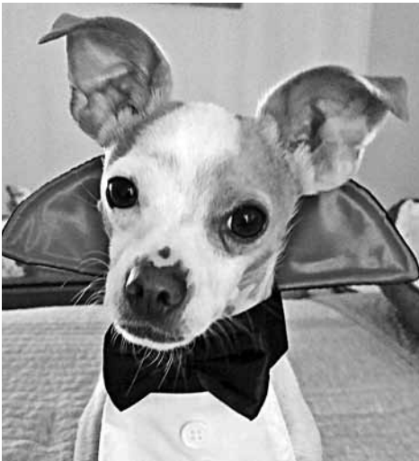
"Dracu-Ollie".