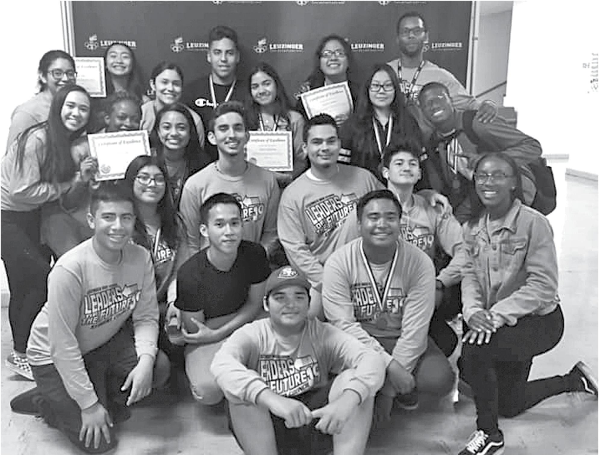
Leuzinger High School recently congratulated over 400 honor roll students 10-12 grade who achieved grade point averages of 3.5 or higher. Here are a few of the hard-working young leaders.