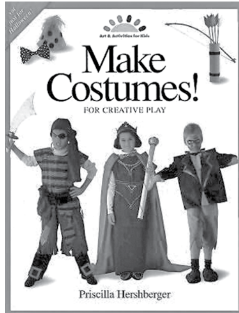
Make Costumes! For Creative Play by Priscilla Hershberger.

all. They are exactly what the doctor ordered to encourage creative play at home. If your little one loved to play dress up or act out stories these costumes, props and accessories are sure to be welcome additions! The book has step