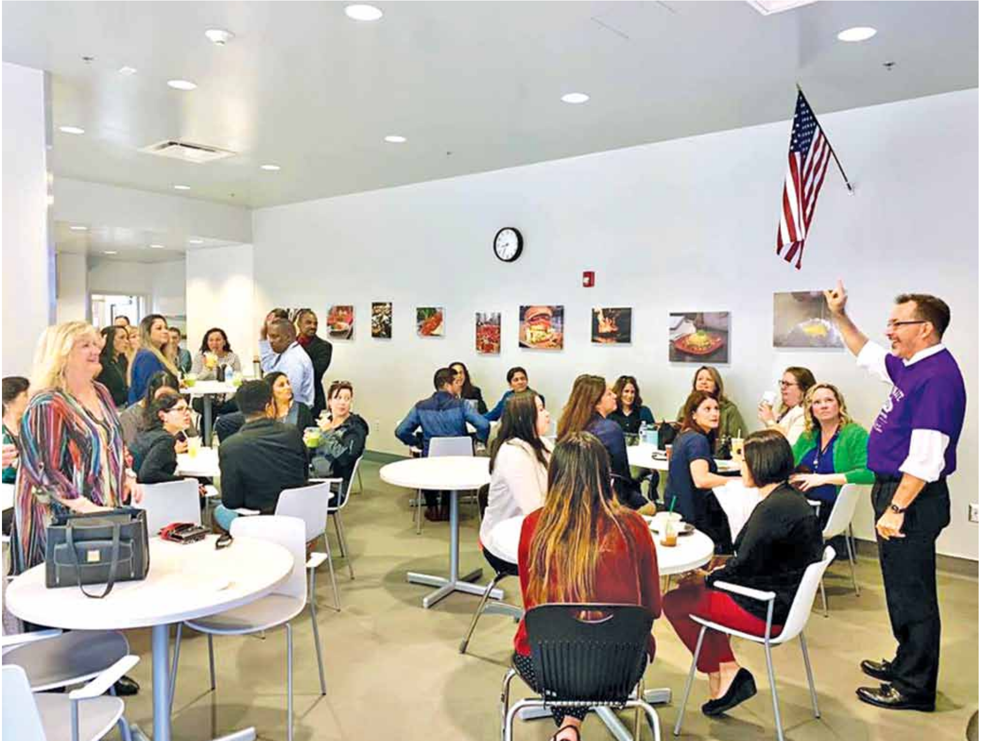
The first annual “Get to Know Us” tour at Hawthorne High School, Lawndale High School and Leuzinger High School for Centinela Valley Union High School District personnel was vital for ongoing partnerships.

“A good teacher can inspire hope, ignite the imagination, and instill a love of learning.”