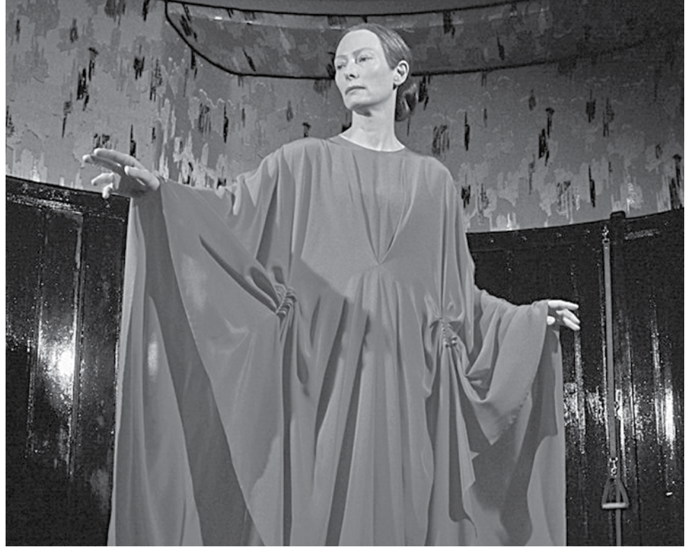
Suspria

film, where powerful thrusts and quick choreographed moves are set to the ebb and flow of inhalations and exhalations, building to a symphony of senses and an orchestration of evil. But it's the time in between these moments—a politically uninteresting side story and a barely motivated Dr. Josef Klemperer (look closer at "his" makeup and re-look at