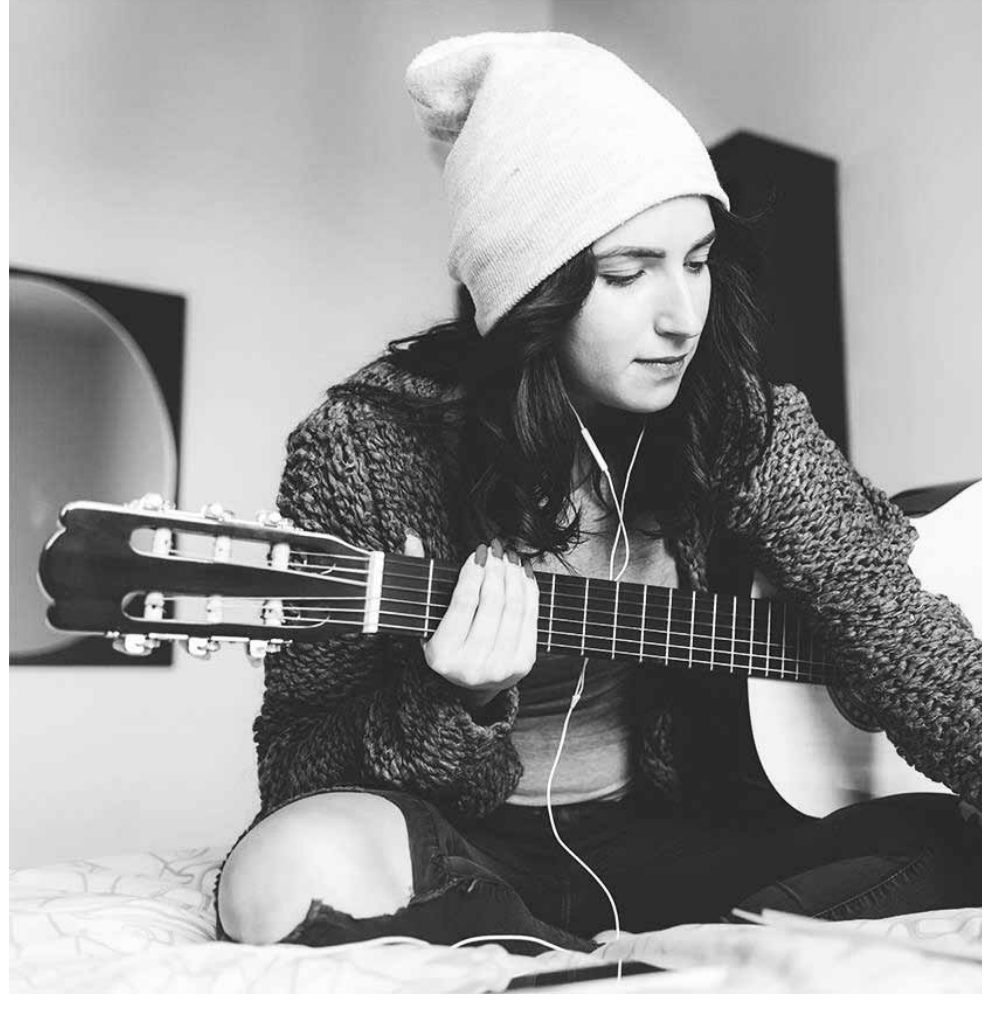
receipts are deductible.

Taxpayers who miscalculate taxes owed are likely to get a form called a CP2000 from the IRS. Whether you work full time and earn a little extra cash from a side hustle or you're a full-time contractor, meticulous record-keeping is a must. Once a quarter, as you determine what you'll owe for quarterly tax payments, make note of which of those