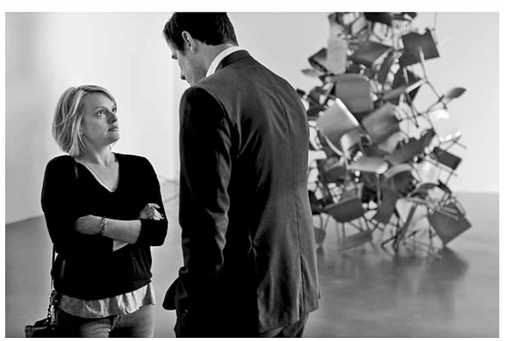
Elisabeth Moss and Claes Bang in The Square . Courtesy of Magnolia Pictures