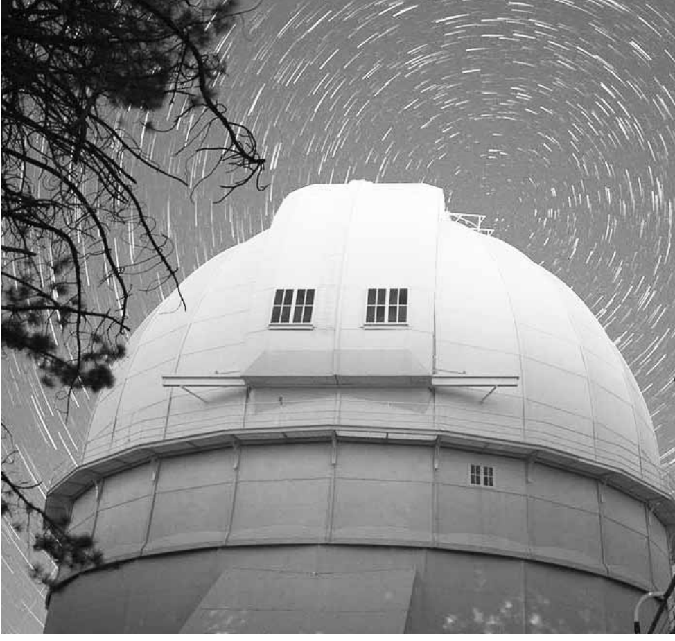
Mount Wilson Observatory

From dark to 10 p.m., assuming the weather permits, the 100-inch telescope will be open to the public for free viewing. The telescope will be pointed at different objects during this time, so visitors can file in and take a peek through the famous telescope that Edwin Hubble used to