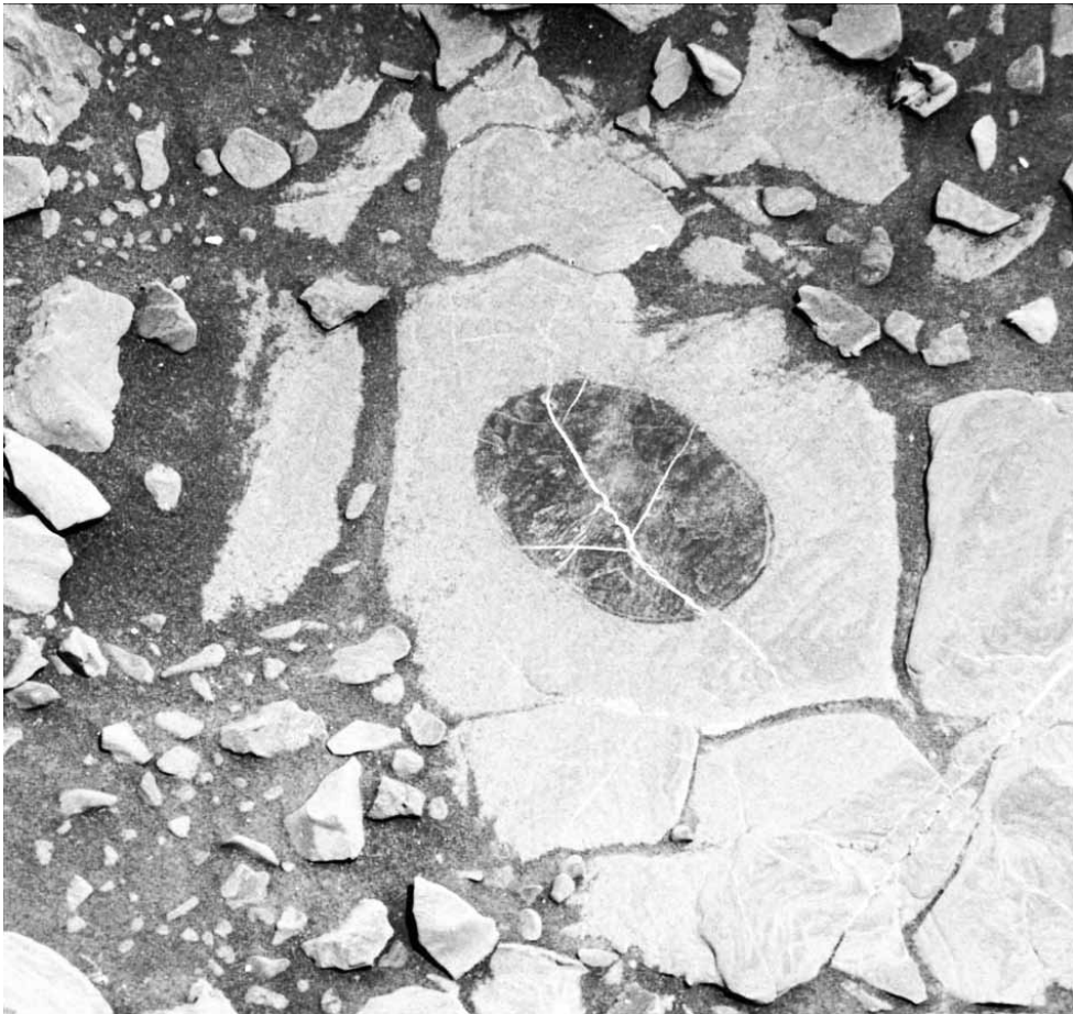
This false-color image demonstrates how use of special filters available on the Mast Camera (Mastcam) of NASA’s Curiosity Mars rover can reveal the presence of certain minerals in target rocks.

a planned destination for Curiosity before the rover landed five years ago. Spectrometer observations from orbit revealed hematite here. Most hematite forms in the presence of water, and the mission focuses on clues about wet environments in Mars’ ancient past. It found