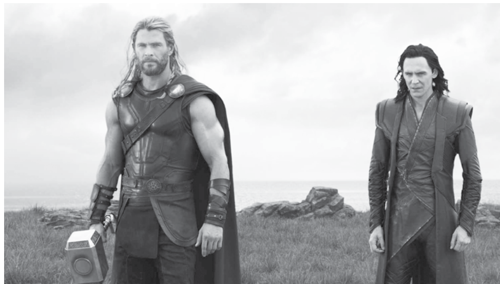
Chris Hemsworth and Tom Hiddleston in Thor: Ragnarok.

Thor: Ragnarok is rated PG-13 for intense sequences of sci-fi violence and action, and brief suggestive material. 130 minutes. Now playing in theaters everywhere. •