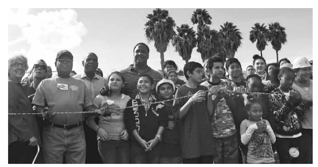
Volunteers of all sizes teamed up to make the playground a reality.