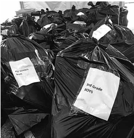
Bags of toys headed to charities.