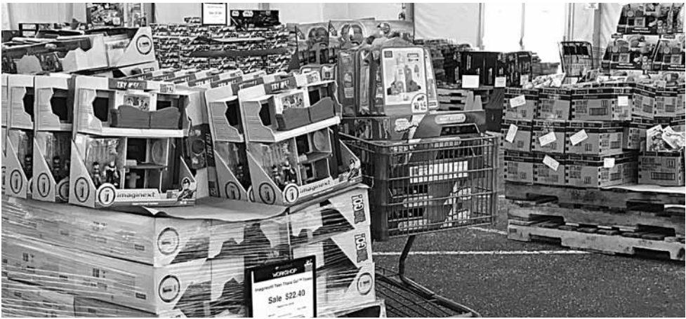
Toys, games and dolls in the holiday tent.