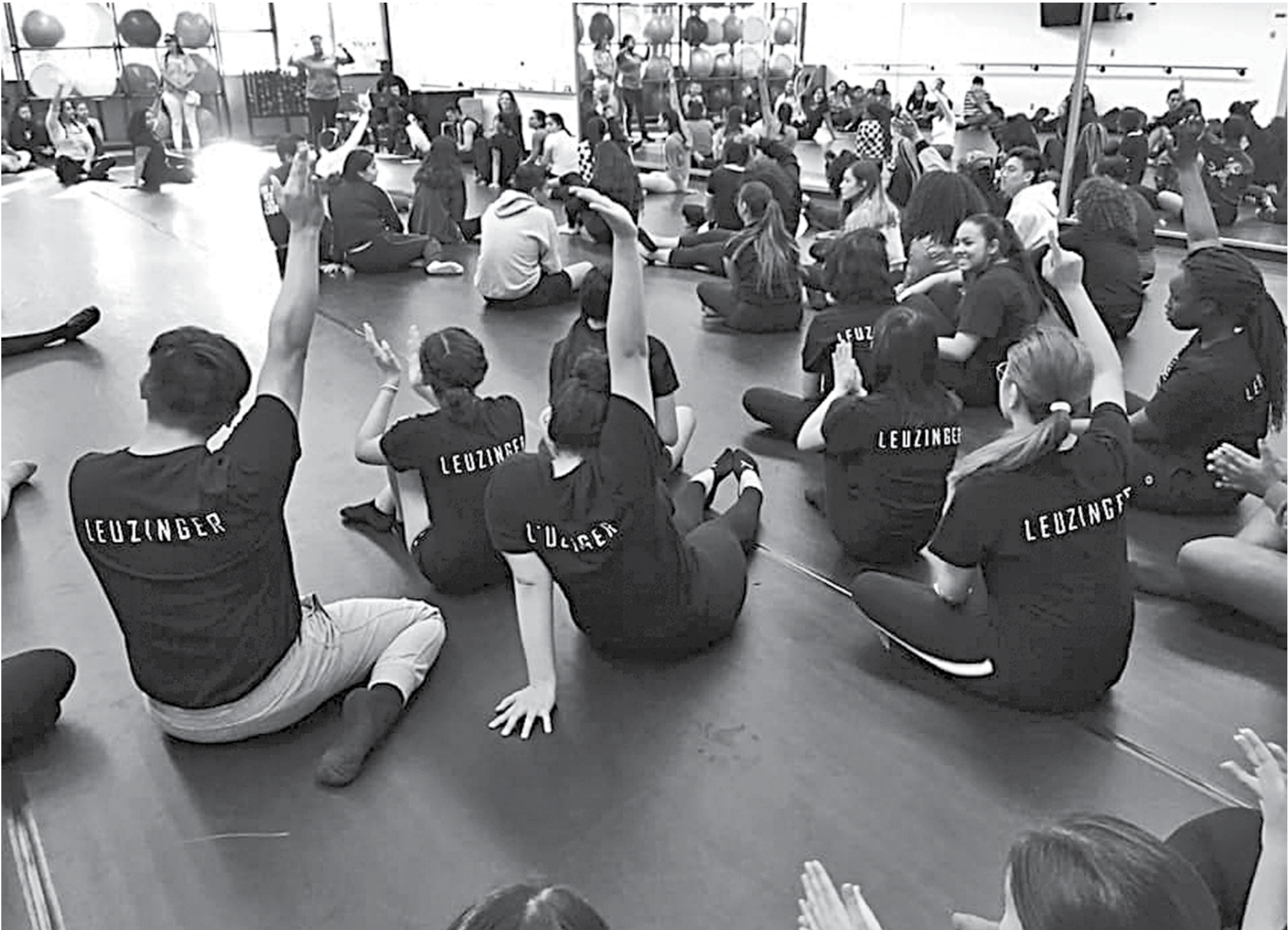
Leuzinger, Lawndale and Hawthorne high school students enjoying dance at West Los Angeles College.