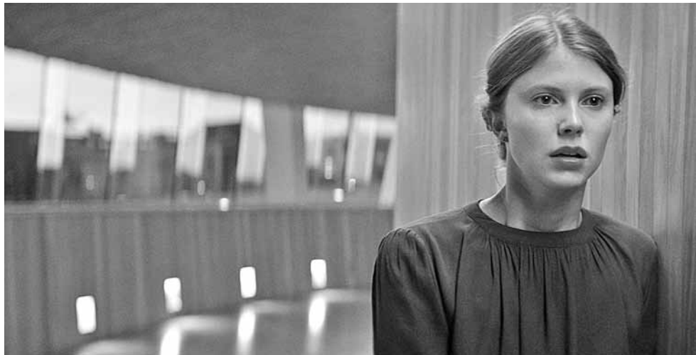
Eili Harboe in Thelma .