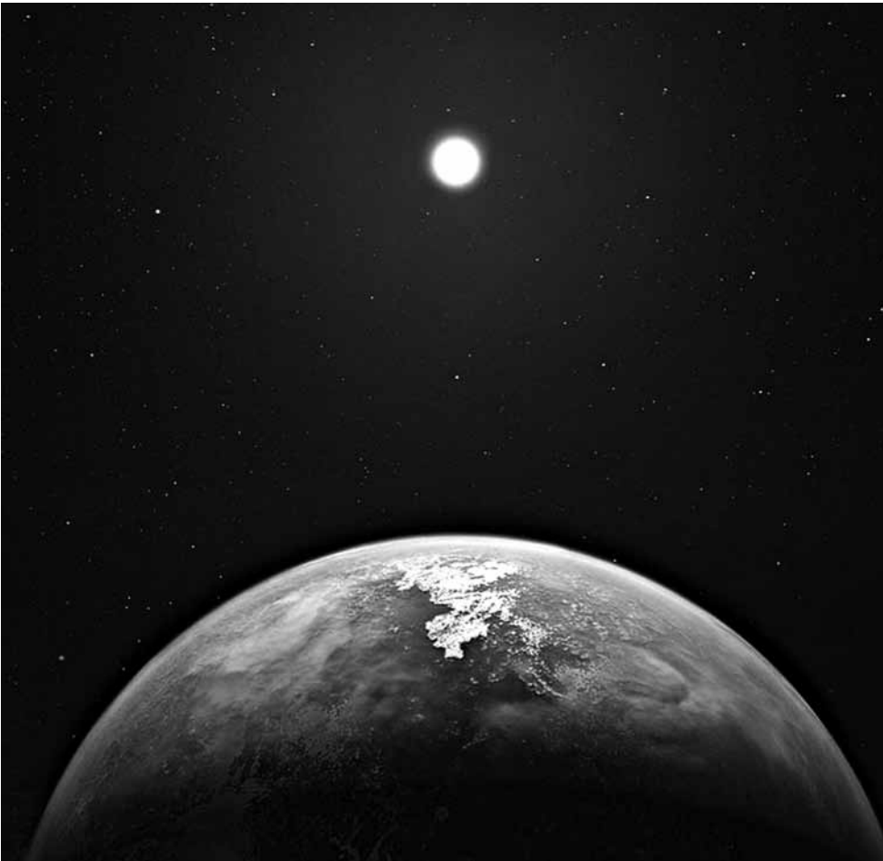
This artist’s impression shows the temperate planet Ross 128 b, with its red dwarf parent star in the background. Credit: ESO/M. Kornmesser

Centauri, are subject to flares that occasionally bathe their orbiting planets in deadly ultraviolet and X-ray radiation. However, it seems that Ross 128 is a much quieter star, without such flares, and so its planets may be the closest