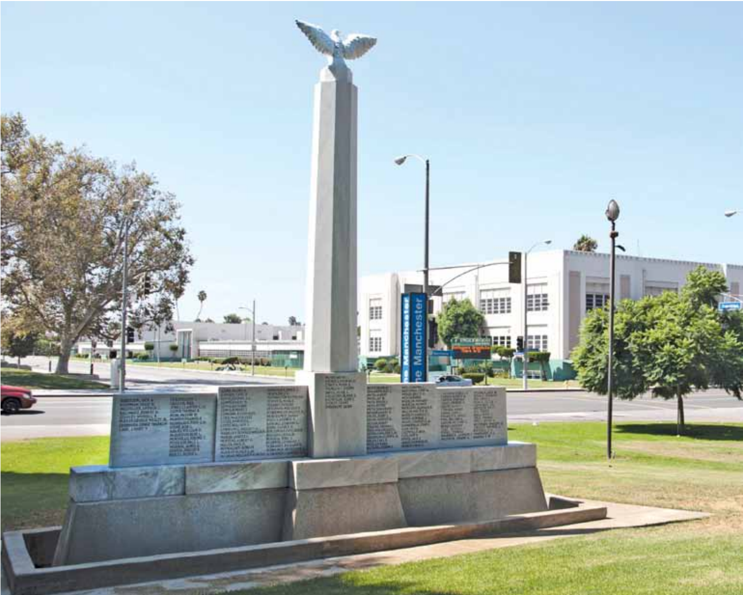
View of the Veteran’s Memorial outside of Inglewood City Hall. The memorial is dedicated to the veterans who gave their lives in the Korean War, Vietnam, and World War II. The inscription says, “To Keep Forever Living the Freedom For Which They Died.”