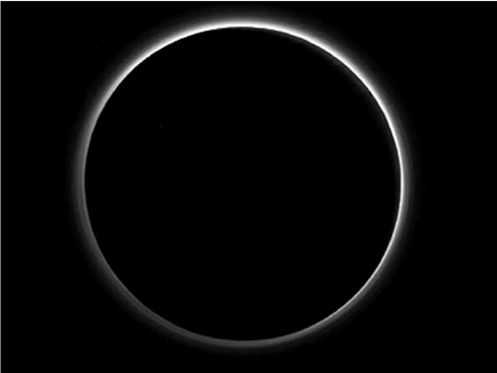
Pluto’s haze layer is blue in this image taken by the New Horizons Ralph/Multispectral Visible Imaging Camera and computer generated to replicate true color. Haze is produced by sunlight-initiated chemical reactions of nitrogen and methane, leading to small particles that grow and settle toward the surface.

The cooling mechanism involves the absorption of heat by the haze particles, which then emit infrared radiation, cooling the atmosphere by radiating energy into space.