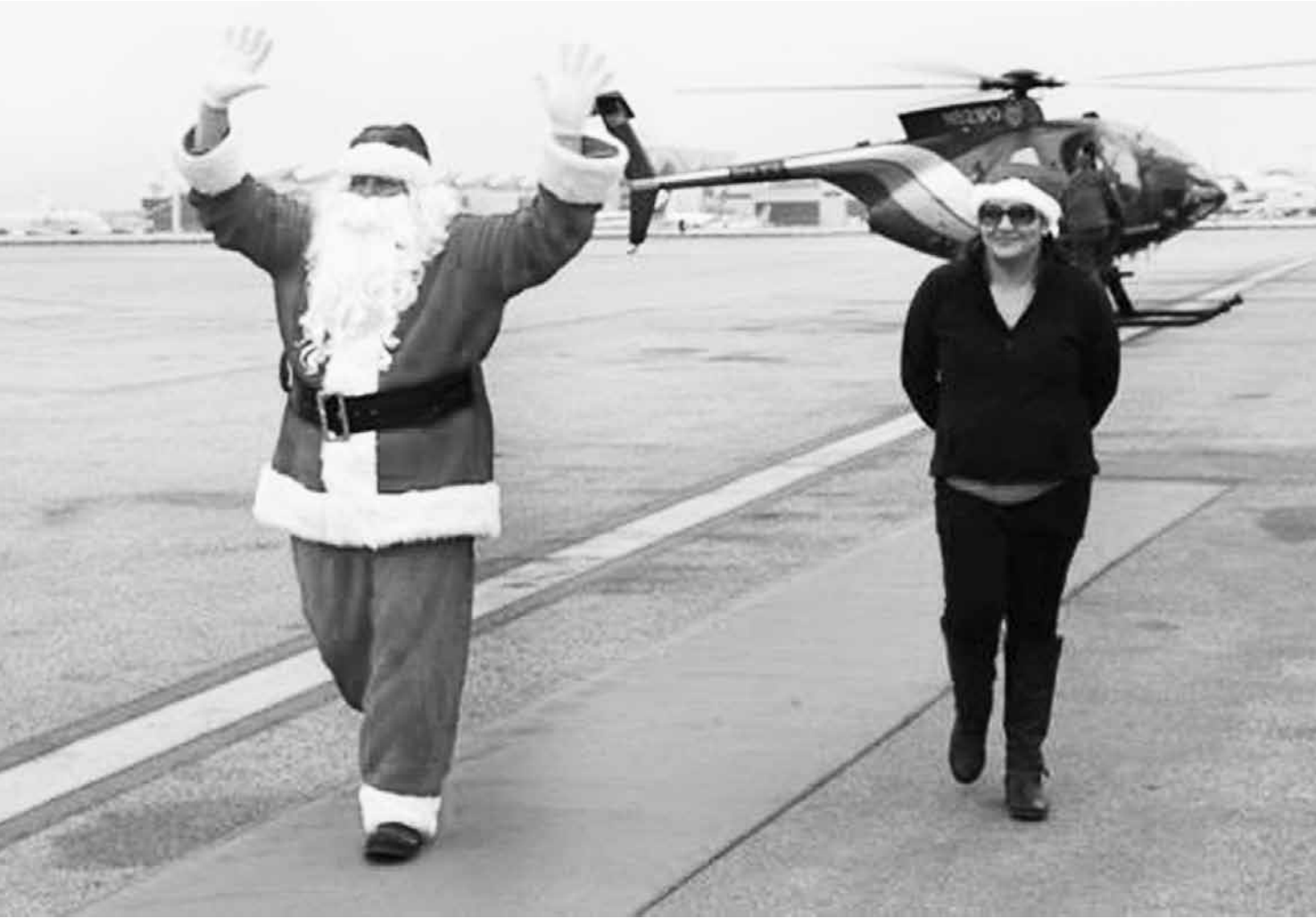
Santa Claus flew to Los Angeles International Airport (LAX) for a pre-holiday visit by helicopter last weekend to spread holiday cheer to nearly 350 pre-kindergarten and kindergarten students from eight local schools, including several from Hawthorne, Inglewood and Wiseburn. The annual LAX Santa Fly-in festivities were held airside of the LAX Flight Path Learning Center & Museum.