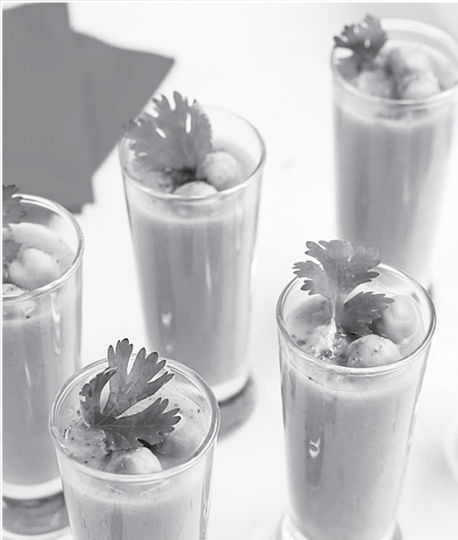
For more seasonal recipe ideas, visit www.simplyorganic.com , provided by BPT.