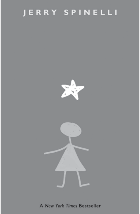
Stargirl by Jerry Spinelli

Stargirl is probably not a title that you recognize at your local library’s shelf and it could possibly be because author Jerry Spinelli decided to represent the title with pictures instead of words. This results in a small yellow star and a stick figure of a girl, which represent the title, Stargirl . This may be confusing to the readers, but the pictures in the title are worth a thousand words.