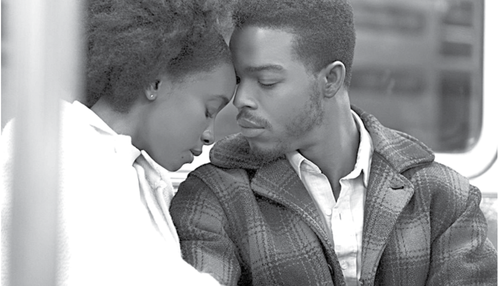
If Beale Street Could Talk, Courtesy of Annapurna Pictures.

Unlike Moonlight , however, Beale Street jumps the narrative timeline and instead floats in and out of Tish and Fonny’s life together and apart. Another inventive technique is how the characters share their intimate conversations of distress and longing while looking directly into the camera. They address each other while visually addressing the audience, which can