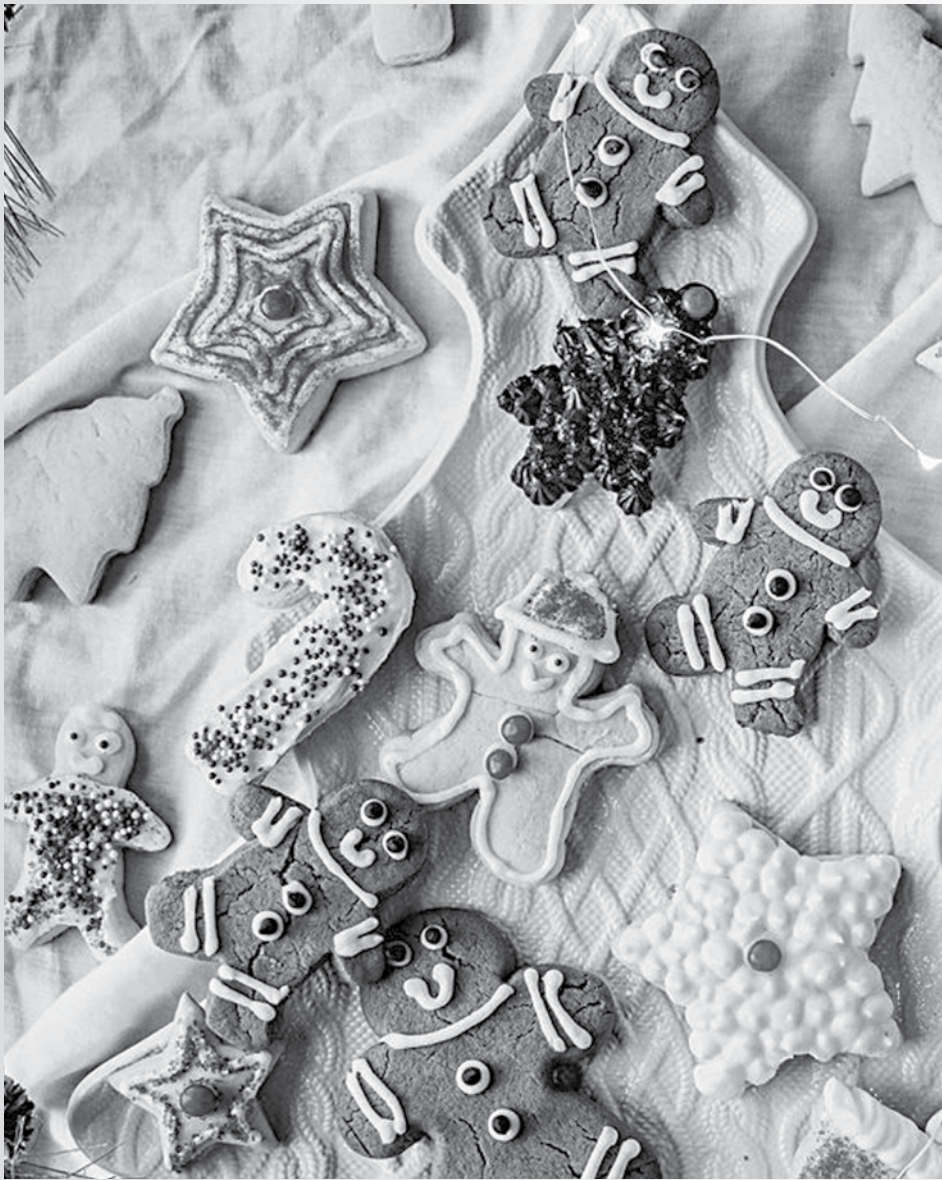
Recipe provided by Brandpoint