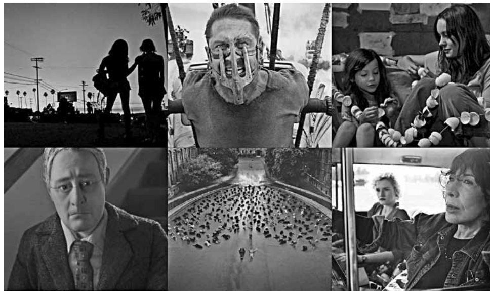
(L-R) Tangerine, Mad Max: Fury Road, Room, Grandma, White God, Anomalisa.