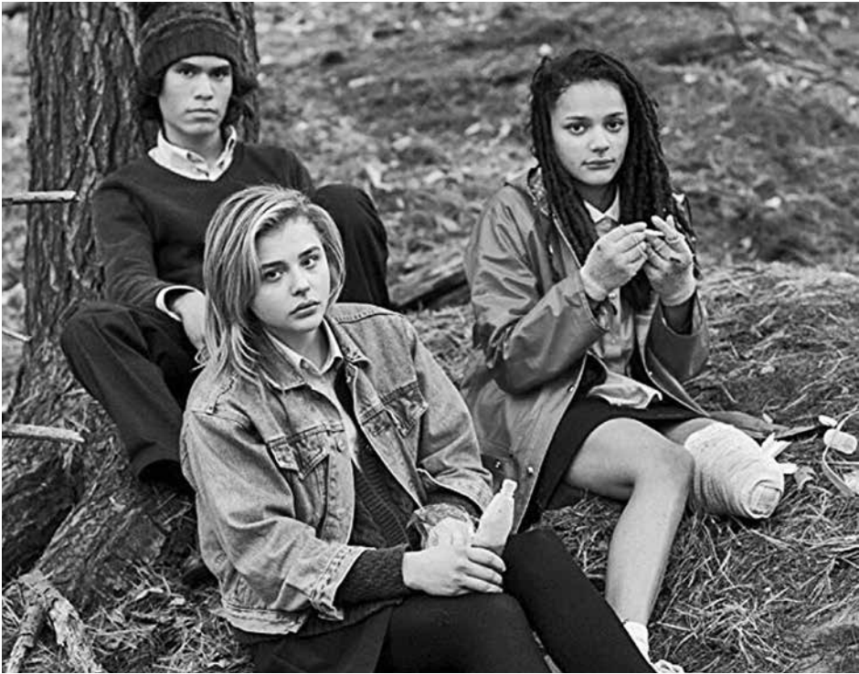
Chloë Grace Moretz, Forrest Goodluck, and Sasha Lane in The Miseducation of Cameron Post.