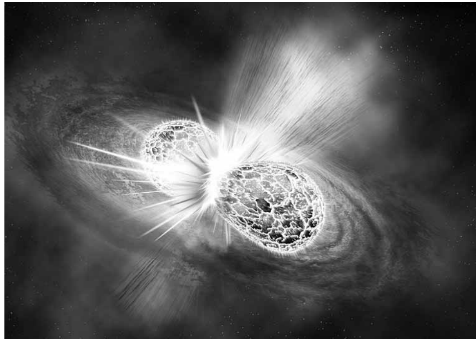
Neutron merger.