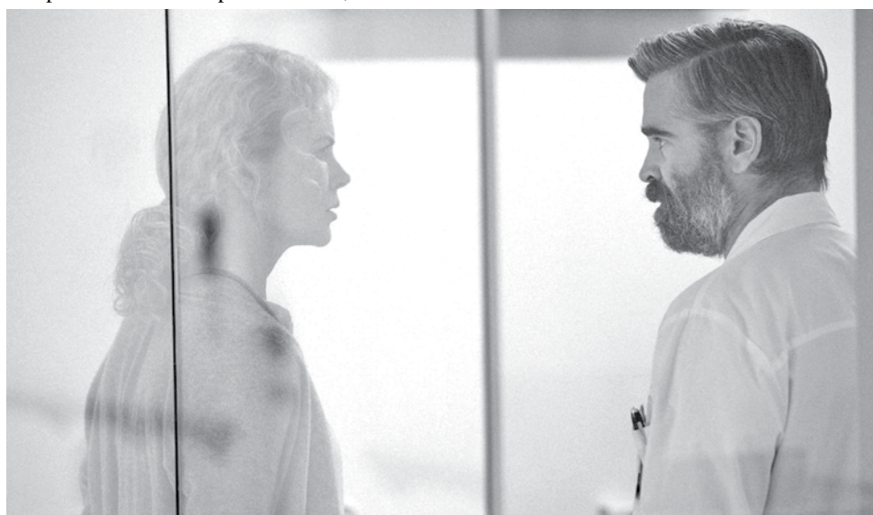
Nicole Kidman and Colin Farrell in The Killing of a Sacred Deer.

The Killing of a Sacred Deer is rated R for disturbing violent and sexual content, some graphic nudity and language. 116 minutes. Now playing at the ArcLight Hollywood and The Landmark. •