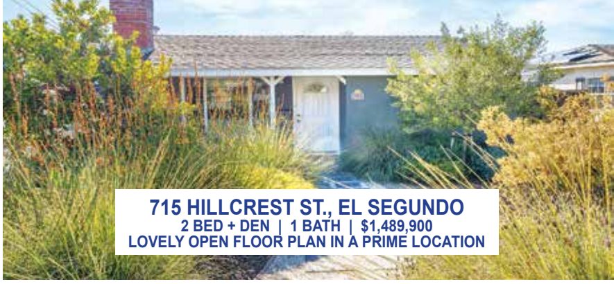
715 HILLCREST ST., EL SEGUNDO 2 BED + DEN | 1 BATH | $1,489,900 LOVELY OPEN FLOOR PLAN IN A PRIME LOCATION