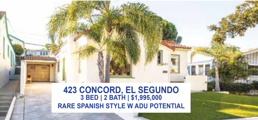
423 CONCORD, EL SEGUNDO 3 BED | 2 BATH | $1,995,000 RARE SPANISH STYLE W ADU POTENTIAL