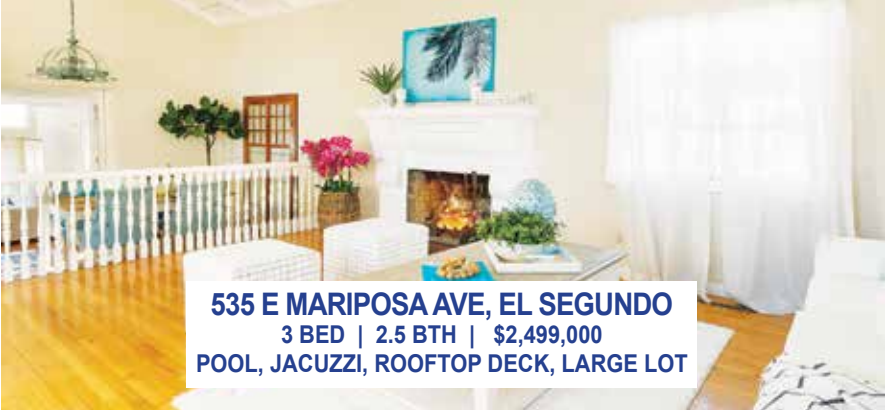
535 E MARIPOSA AVE, EL SEGUNDO 3 BED | 2.5 BTH | $2,499,000 POOL, JACUZZI, ROOFTOP DECK, LARGE LOT