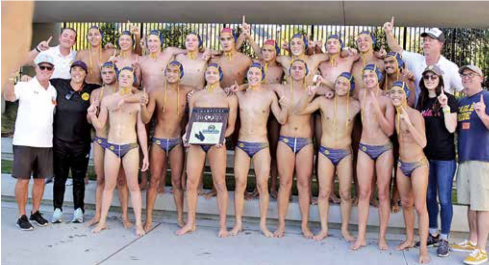
The Eagles finished their season 32-0 and captured the program's fourteenth CIF Southern Section title.

The El Segundo American Legion Blues faced some of the state's top American Legion teams after winning their league tournament. They faced East Bay (Antioch) in the opening round and won 11-4. In the second round, the Blues faced West Hills (Santee) and came from behind to win 7-5. In the third game, the Blues faced the Petaluma Leghorns, the four-time defending state champions, and put together an exciting 12-10 victory. Since the Blues were undefeated in tournament play, it meant the Yuba City Stripers would need to defeat El Segundo twice to win the championship. The Stripers did the unthinkable by handing the Blues an 11-1 loss in the first game and a 9-4 loss in the championship elimination game.