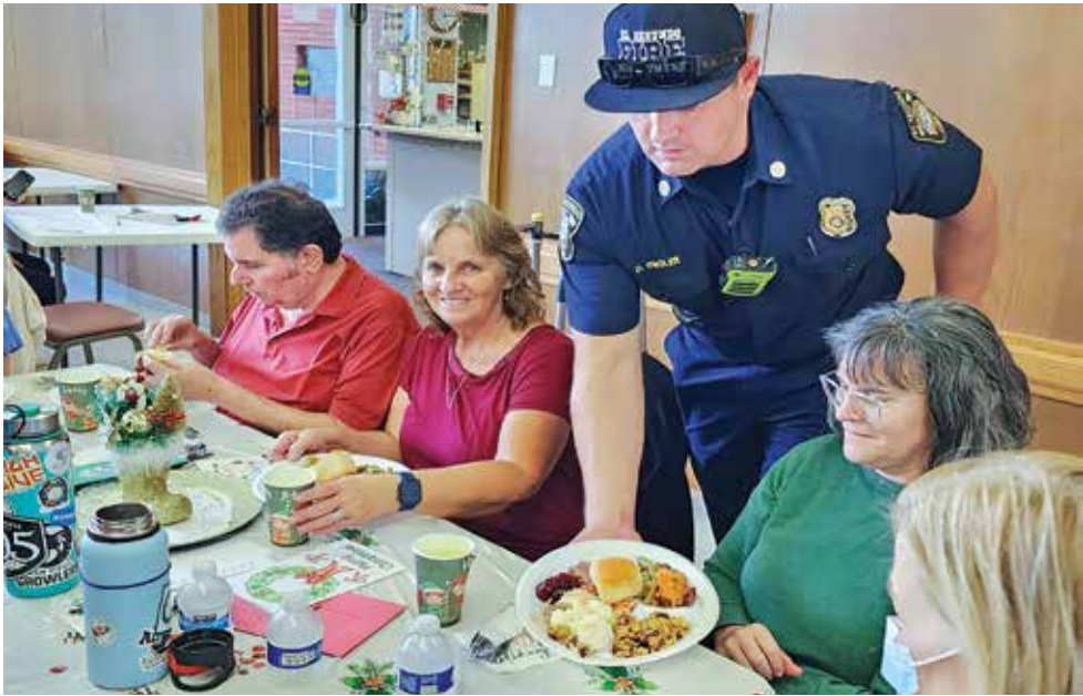
Guests being served by an El Segundo firefighter.