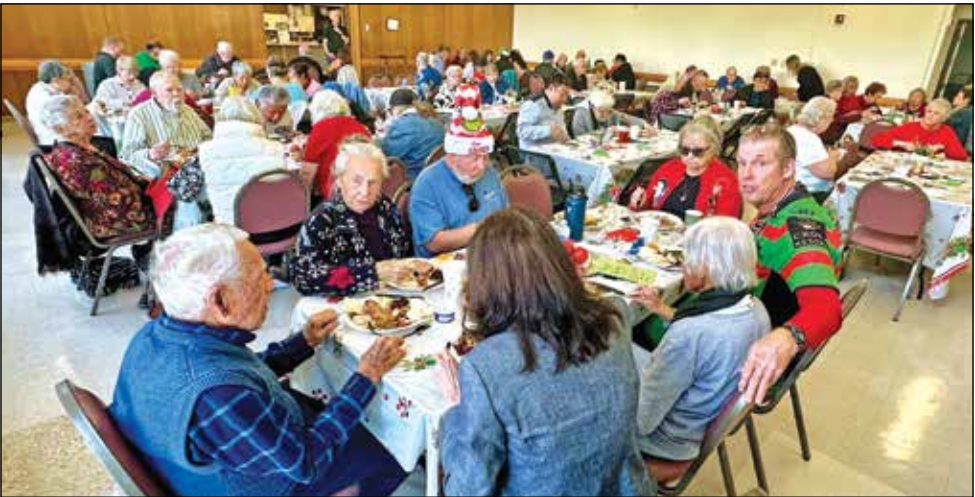
Guests enjoying their holiday meal.