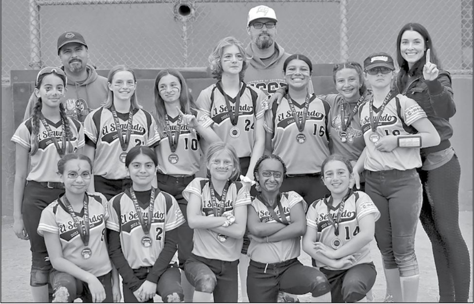
The ESGSL 12U champion Iron Maidens pose with their championship medals.