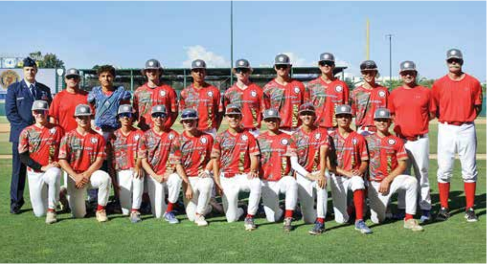
The El Segundo American Legion team finished second at the California American Legion State Tournament.

The boys' basketball team is off to a 10-6 record and is top-ranked in the CIF-SS