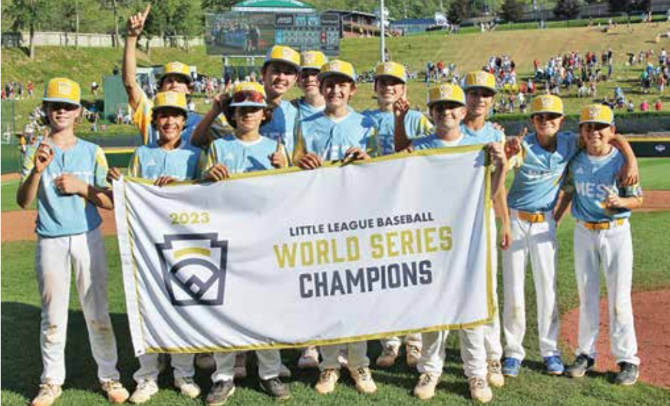
The El Segundo Little League All-Stars defeated a team from Curacao to win the 76th Little League World Series.

Our community was mesmerized, along with the rest of the nation, by what twelve players and the three coaches accomplished at the Little League World Series. Playing in front of tens of thousands of fans and a national TV audience the stage was never too intimidating.