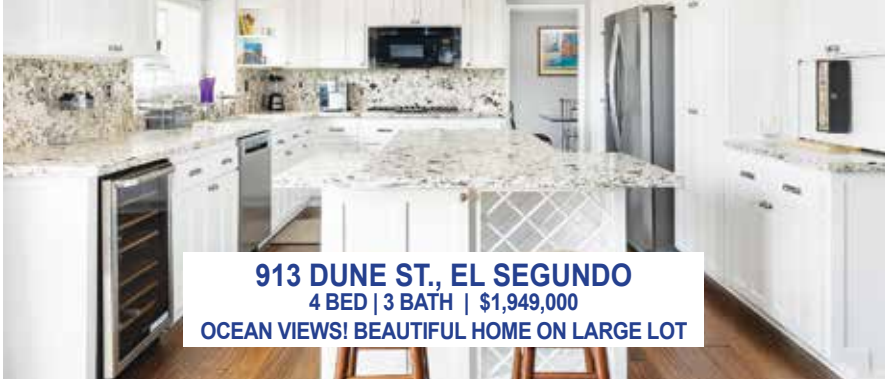
913 DUNE ST., EL SEGUNDO 4 BED | 3 BATH | $1,949,000 OCEAN VIEWS! BEAUTIFUL HOME ON LARGE LOT