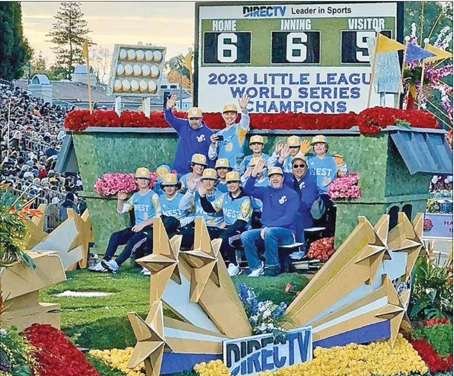
The El Segundo Little League All Star Team rode on the DirectTV float in the Rose Parade. They are the first Little League World Series champions to be featured on a float in the Rose Parade.