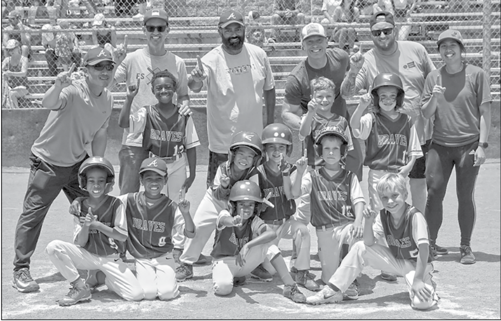
Double-A Braves celebrated their 11-10 win in the championship game.