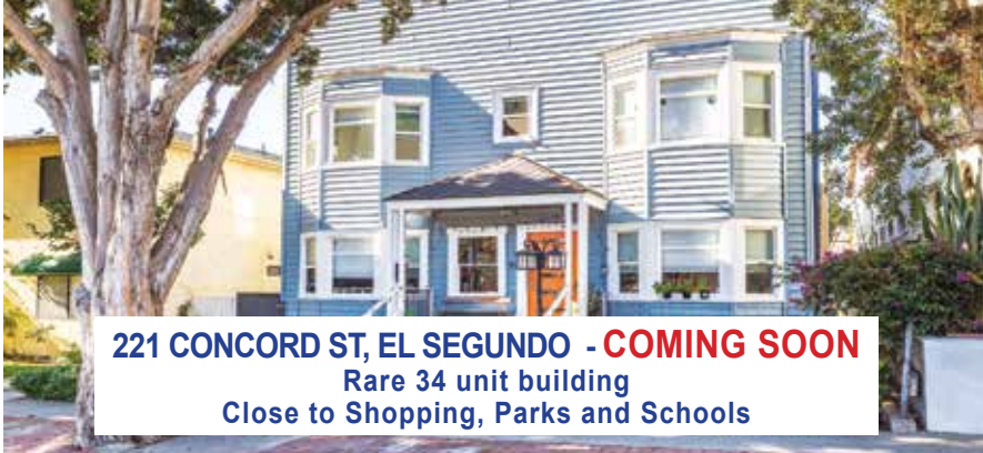
221 CONCORD ST, EL SEGUNDO - COMING SOON Rare 34 unit building Close to Shopping, Parks and Schools