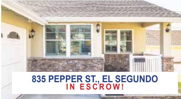
835 PEPPER ST., EL SEGUNDO IN ESCROW!