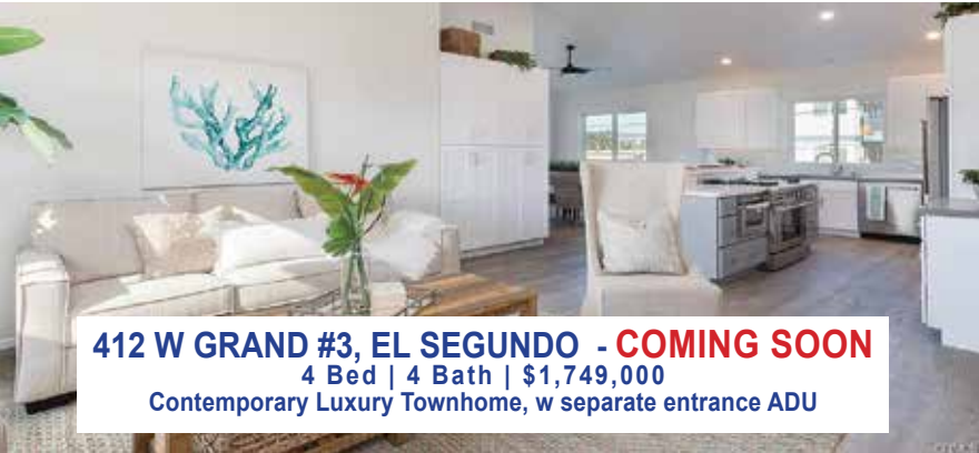
412 W GRAND #3, EL SEGUNDO - COMING SOON 4 Bed | 4 Bath | $1,749,000 Contemporary Luxury Townhome, w separate entrance ADU