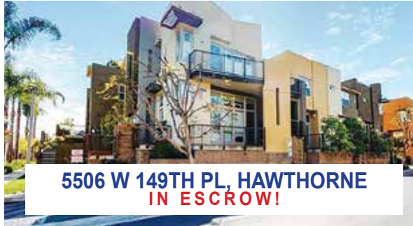
5506 W 149TH PL, HAWTHORNE IN ESCROW!

FREE MARKET EVALUATION | PRIVATE CONSULTATIONS | 7 DAYS A WEEK, 9AM-9PM