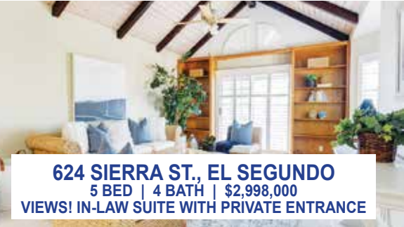
624 SIERRA ST., EL SEGUNDO 5 BED | 4 BATH | $2,998,000 VIEWS! IN-LAW SUITE WITH PRIVATE ENTRANCE