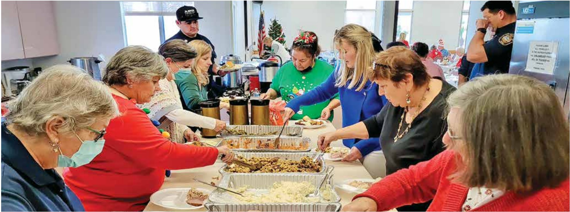
Volunteers in the kitchen.