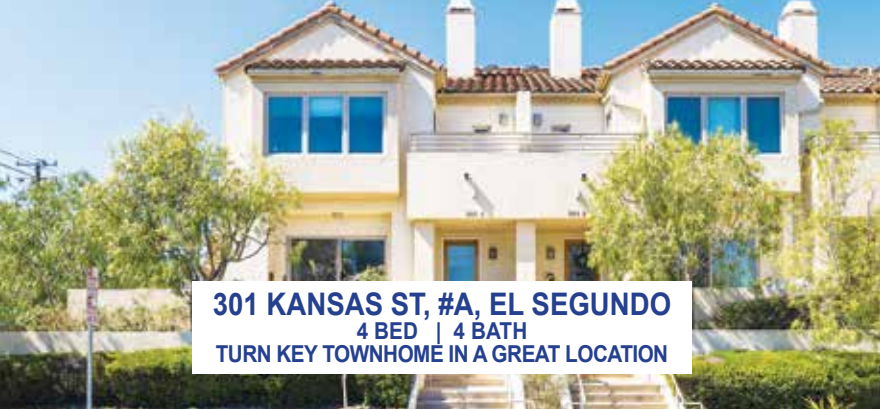
301 KANSAS ST, #A, EL SEGUNDO 4 BED | 4 BATH TURN KEY TOWNHOME IN A GREAT LOCATION