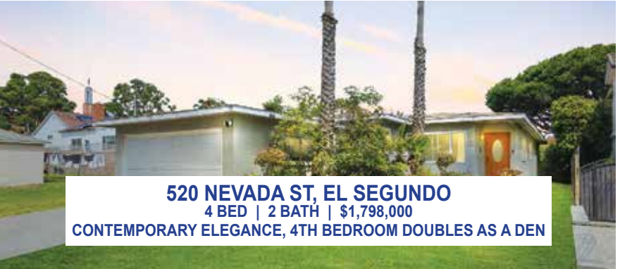
520 NEVADA ST, EL SEGUNDO 4 BED | 2 BATH | $1,798,000 CONTEMPORARY ELEGANCE, 4TH BEDROOM DOUBLES AS A DEN