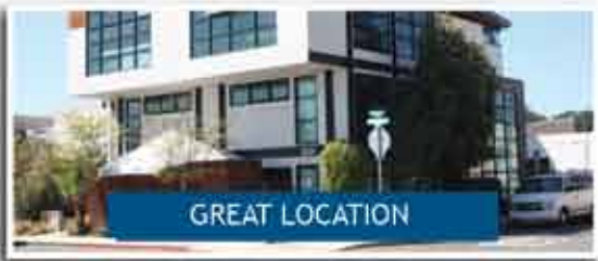
GREAT LOCATION "Rock & Brews Headquarters" Creative space. Built in 2007. A live/work loft in Smoky Hollow. 2100 sq.ft. and 1 block to Main Street.

Warehouse / Office / Retail for LEASE & SALE in EL Segundo 3000 to 6000 sqft - please call for details