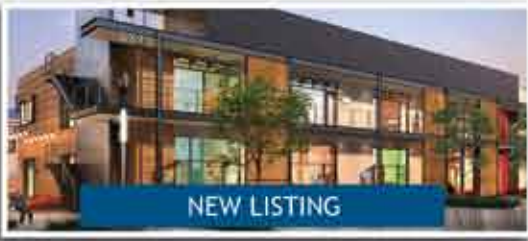
NEW LISTING Brand New Eleven Project 2,200 sq.ft. to 16,000 sq.ft. of creative space for lease or sale.

Own in El Segundo, the newest, most sought after industrial business are for incubators, accelerators, and tech startups. El Segundo, the city that invests in you. The 2nd highest concentration of Fortune 500s in the state of CA. With an unsurpassed business incentive program, low license taxes, leasing rates well below those of the City of LA, & a prime location adjacent to a major airport w/great access to freeways & the beach.