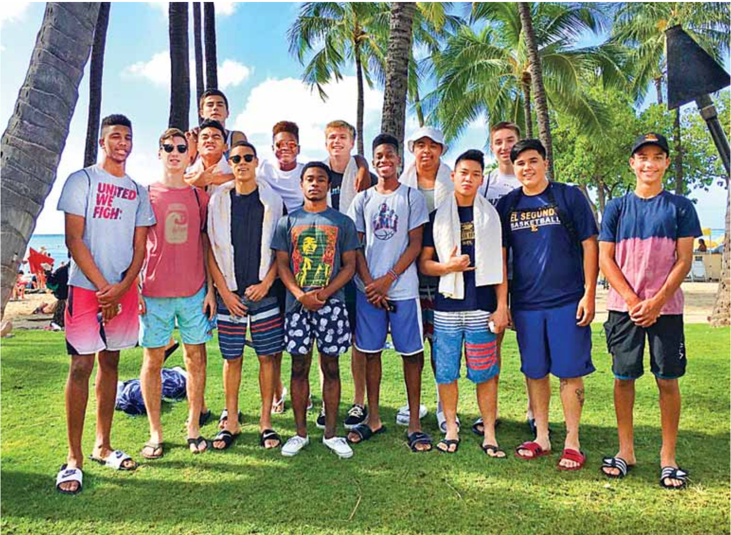
The Eagles took time to visit Waikiki Beach in between games during their trip to Hawaii.