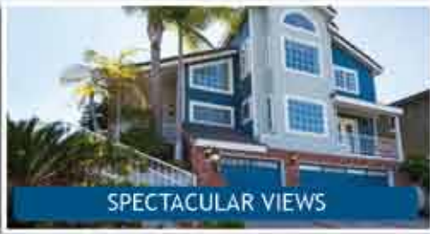
SPECTACULAR VIEWS 601 Lomita Street 4 Bedrooms 3 Bathrooms. Impressive gourmet kitchen. Walking distance to Main Street. $1,899,000