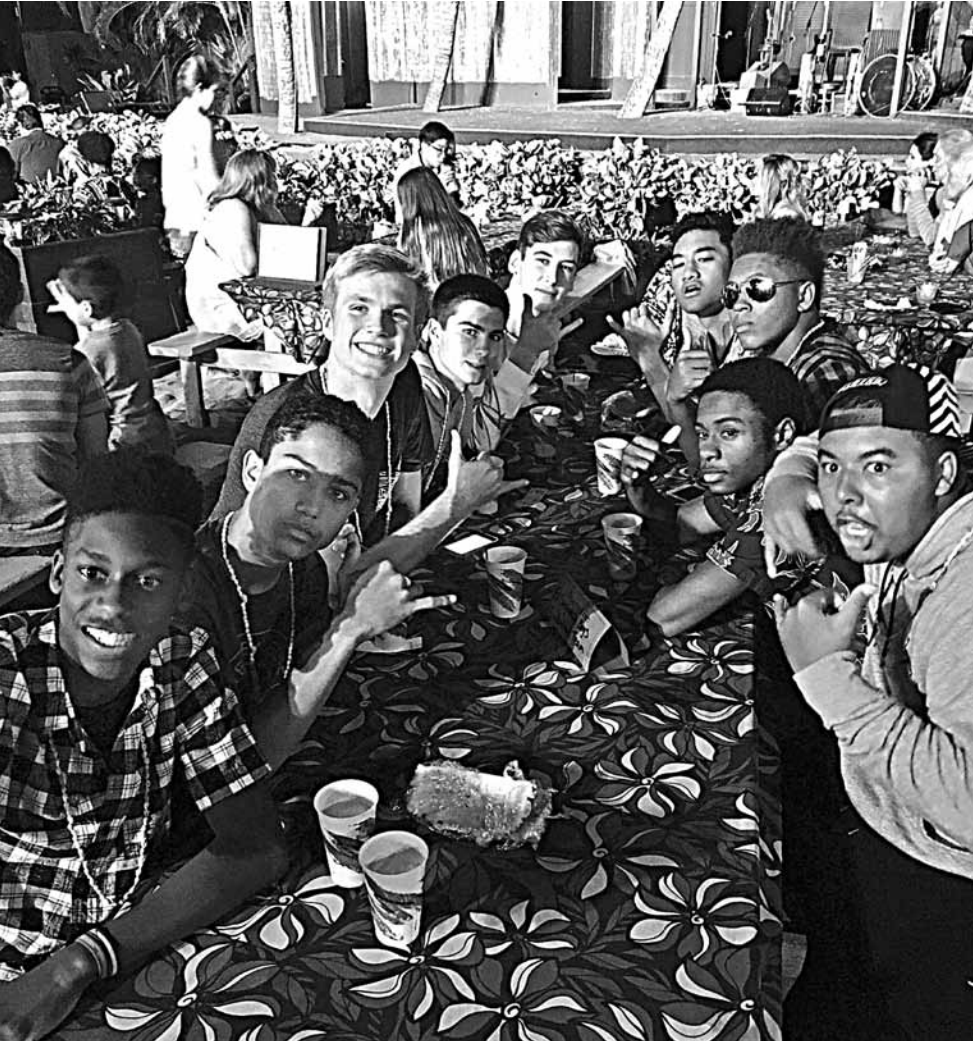
While playing in a tournament in Hawaii the Eagles attended Germaine's Luau.