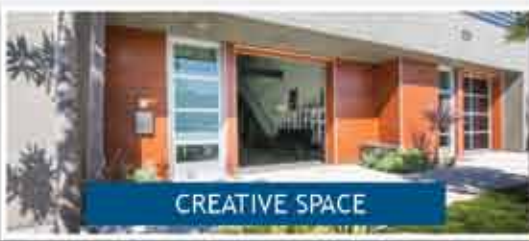
CREATIVE SPACE 219 California Street Fully equipped office condominium is set on a one acre site and has 6 parking spaces.