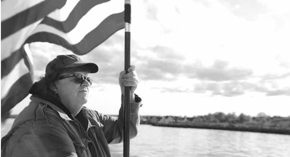
Michael Moore in Where To Invade Next.

Let's start with Michael Moore's divisive title: it's a complete bait and switch. There is an indication from this title and from the movie's opening that this is a movie about the US Military and their dominance worldwide. You'd never guess it, but this