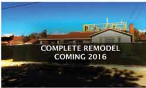
1435 E. MAPLE AVE. Call for details