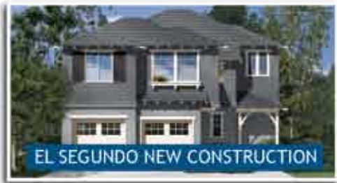
EL SEGUNDO NEW CONSTRUCTION Contemporary Homes Beautiful single family home community all with 4 bedrooms & over 3,000 sqft. Call for details & private showings.