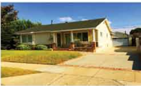
20016 SALTEE ST. TO. Call me for details