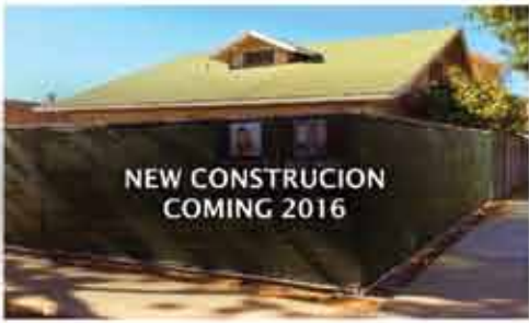
443 WHITING ST. Call for details