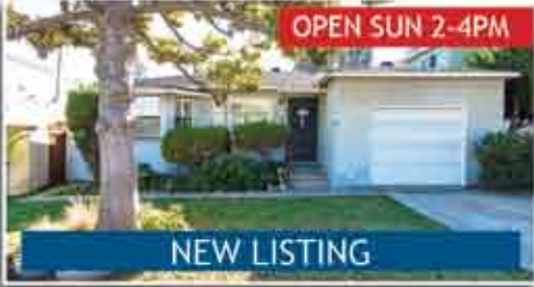
NEW LISTING 1312 E Mariposa Charming 2 bed, 2 bath + den. Home has detached office/work shed on a spacious 6031 sqft lot. $999,999