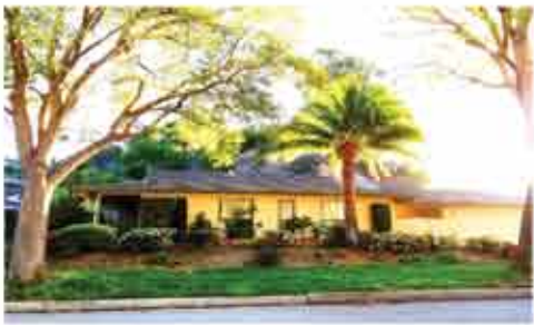
36 ENCANTO DR. R.H.E. Call for details