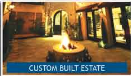
CUSTOM BUILT ESTATE 840 Center 4 bed, 6 bath, 3876 sq ft. 2010 Exquisite custom built estate with inviting courtyard. $2,199,000