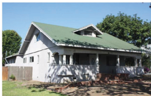
443 Whiting St. List Price: $1,099,000 Sold: $1,255,000 11 Offers Brand New Construction coming

Los Angeles (138%) San Francisco (116%) and San Diego (115%).