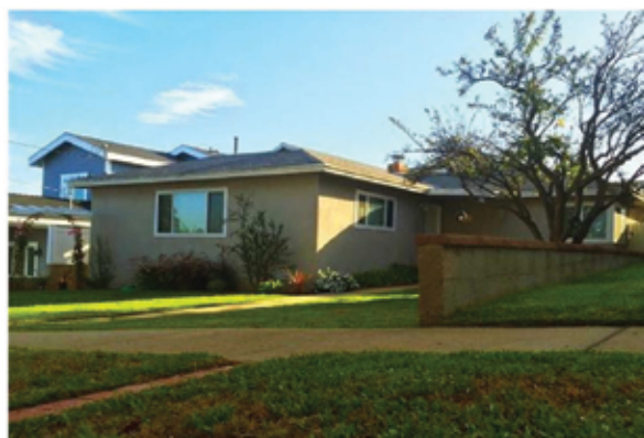
612 Arena St. Sold Off Market: $1,300,000 Brand New Construction coming