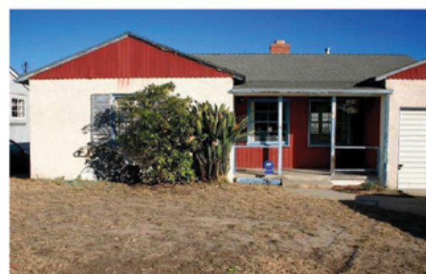
610 Sierra St. List Price: $799,000 55 Offers Pending at well over the list price