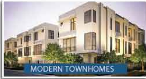
MODERN TOWNHOMES New Construction 3 to 4 bedrooms that range from 1700 to 2400 sqft. Roof top decks. Walking distance to schools, shops and parks.