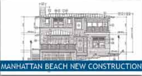
MANHATTAN BEACH NEW CONSTRUCTION New in the Trees Beautiful New Coastal-Plantation Style Home 5860 sqft. of spacious living. 6 bedroom 6.5 bath. Please call for details.

Own in El Segundo, the newest, most sought after industrial business are for incubators, accelerators, and tech startups. El Segundo, the city that invests in you. The 2nd highest concentration of Fortune 500s in the state of CA. With an unsurpassed business incentive program, low license taxes, leasing rates well below those of the City of LA, & a prime location adjacent to a major airport w/great access to freeways & the beach.