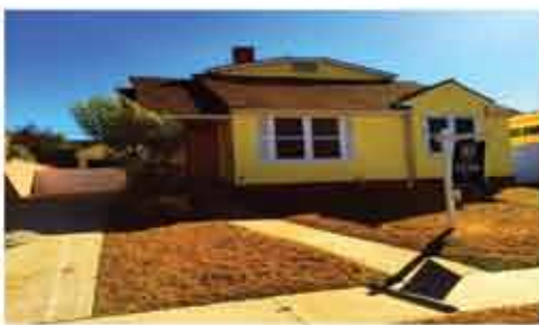
908 LOMITA ST. Call me for details