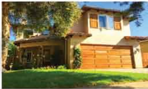
513 W. SYCAMORE ST. 5 Bedrooms - 4.5 Bathrooms