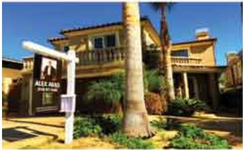
516 PENN ST. 5 Bedrooms - 4.5 Bathrooms