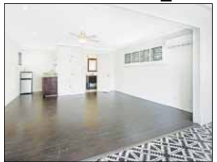
524 Concord, El Segundo, CA Back Unit Studio | Available Now | $1,795