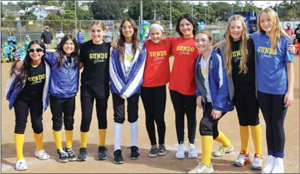
Members of the 10u 2022 All-Stars team pose.

The El Segundo Little League persevered through rainy conditions and a closed Brett