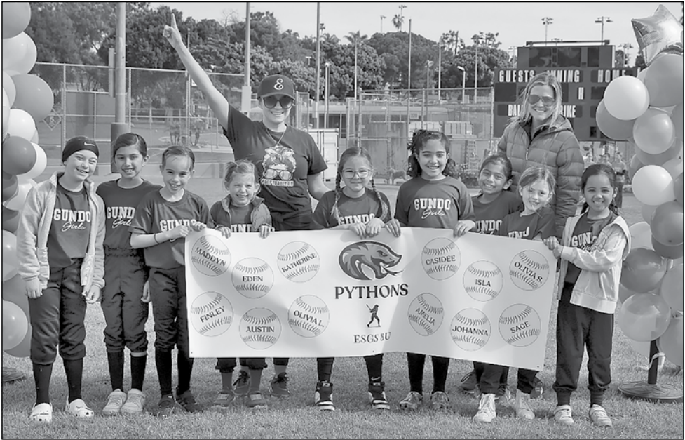
The Pythons pose before entering the field on Opening Day.