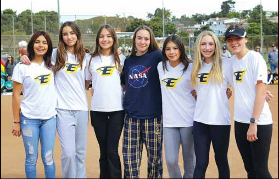
The 12u 2022 All-Stars made it to the Nationals.

until the weather and fields are manageable. The Eagles were hoping to get in games earlier in the week, with games being played at the high school on Monday and North Torrance on Tuesday. Today's game and the rest of the