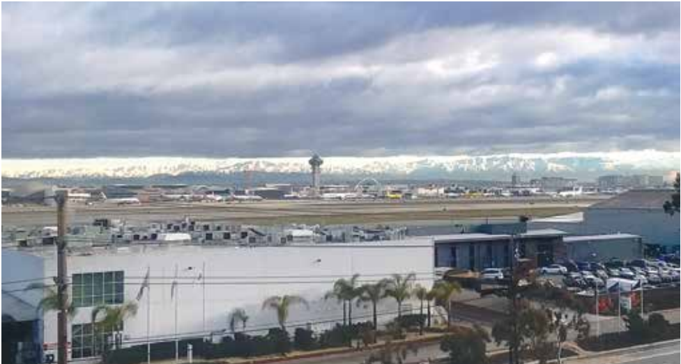
An image of the San Gabriel Mountains covered in snow, located behind LAX. Photo was taken by Jim Marak from the corner of Imperial Ave and Sheldon Street.