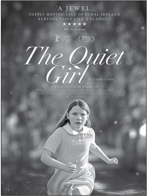
The Quiet Girl, courtesy Cinemacy.com.