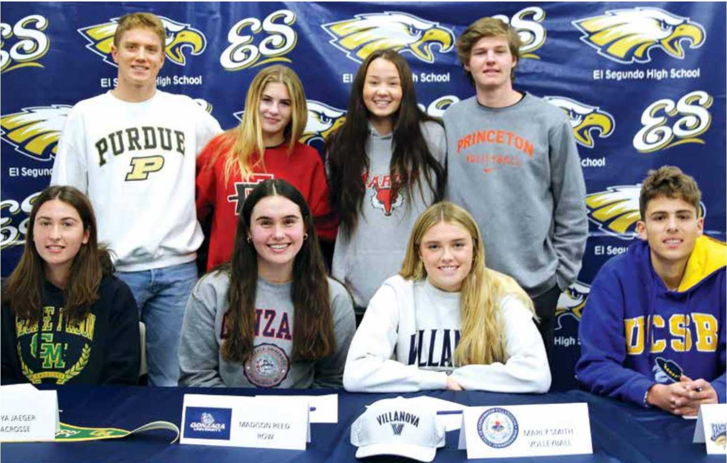
Seniors are all smiles after signing their Letters of Intent. For story, see Sports on page 3.