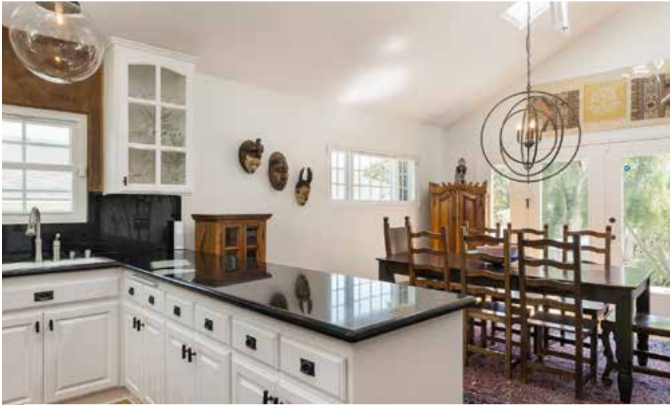
228 W. MAPLE, EL SEGUNDO 4 BED | 3 BATH | 2,672 SQ FT | $2,399,000 The kitchen features granite countertops, a peninsula, all stainless steel appliances This magnificent area is full of natural light.