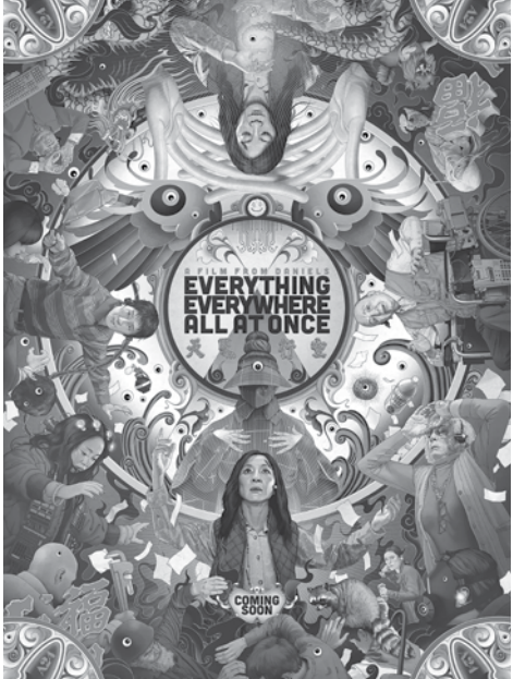
Everything Everywhere All at Once