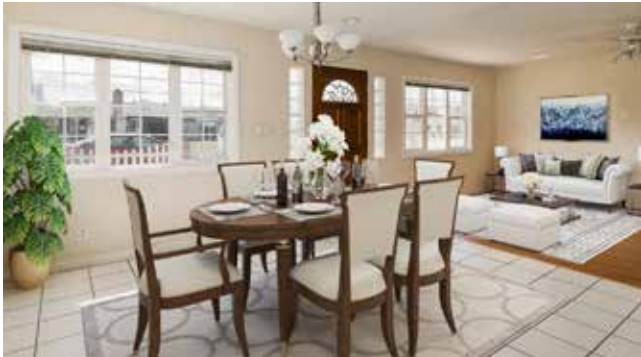
1061 W 210TH STREET, TORRANCE 3 BED | 2 BATH | 1,359 SQ FT | $799,900