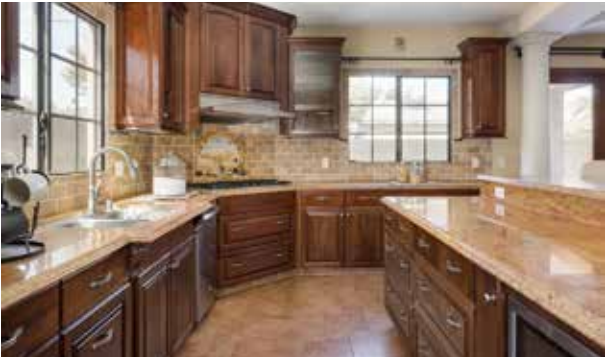
7947 STEWART AVENUE, LOS ANGELES 5 BED | 3 BATH | 3,825 SQ FT | $2,700,000