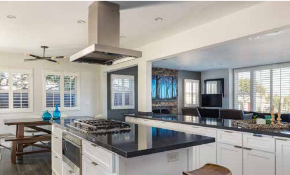
901 MARYLAND STREET, EL SEGUNDO 4 BED | 3 BATH | 2,700+ SQ FT | $2,498,000 The remodeled kitchen features a sizable island, Wolf appliances, barstool seating, plenty of cabinet space.