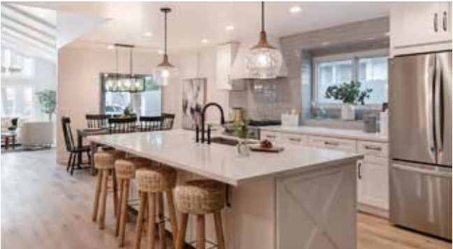
714 REDWOOD AVENUE, EL SEGUNDO 3 BED | 2 BATH | 2,146 SQ FT | $1,952,000