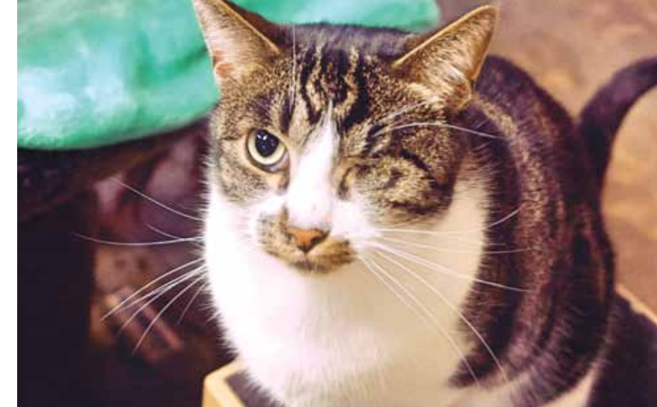
and he has early signs of renal failure. foster parent herself was older and couldn't

Charlie, a 3-year-old brown tabby cat with a missing eye, was rescued and has hope at being adopted.