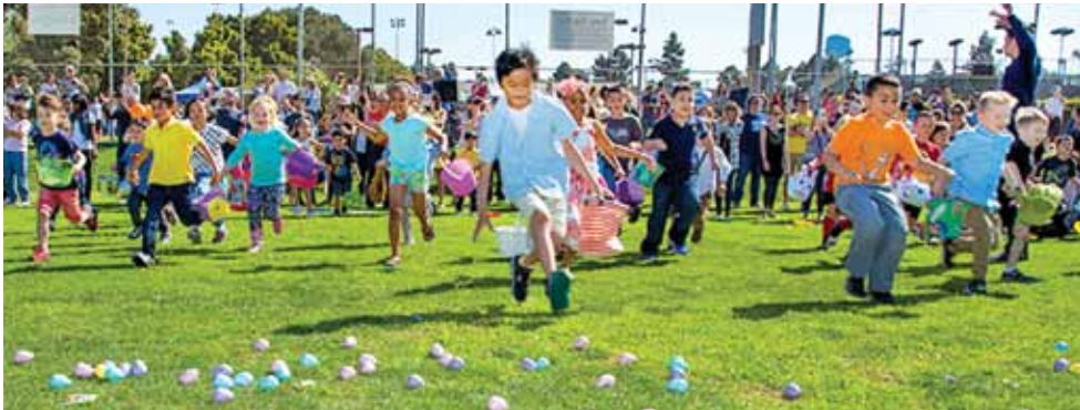
They're off and running to find that golden egg.