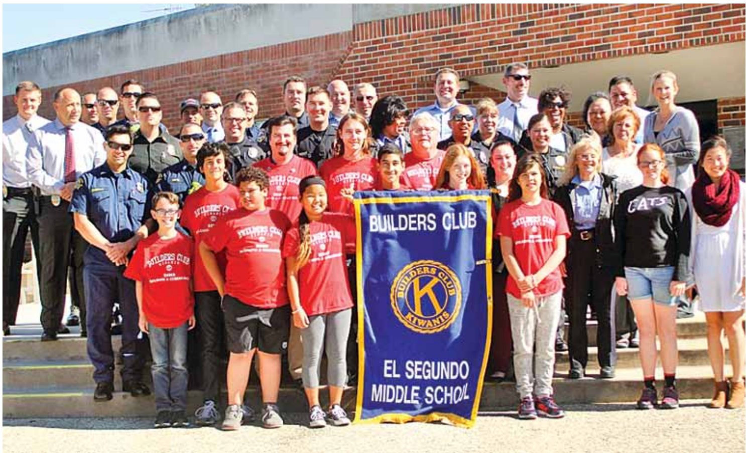
The El Segundo Middle School Builders Club honors El Segundo's finest! Builders Club members stuffed a personalized thank you card and candy into a goodie bag for each member of both the El Segundo Police and Fire Departments as a way of saying how much they are appreciated for serving and protecting our community. •