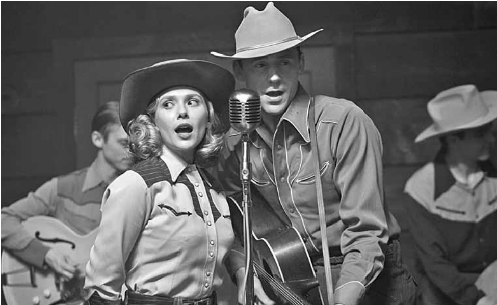
Elizabeth Olsen as Audrey Williams and Tom Hiddleston as Hank Williams.