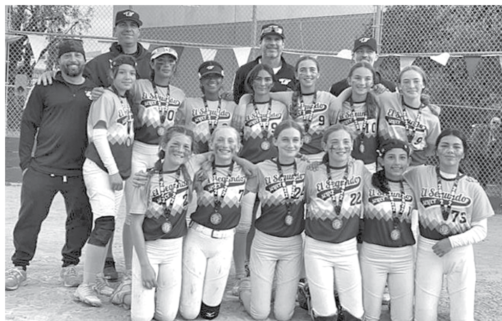
The winning team and their coaches.