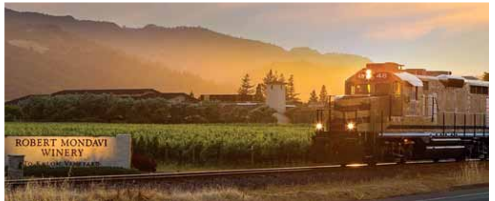
Photo courtesy of Napa Valley Wine Train, article from AAA of Southern California.