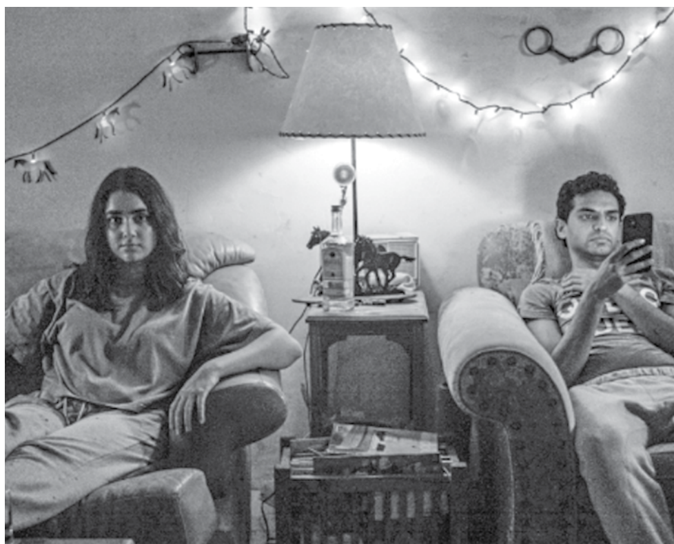
Geraldine Viswanathan and Karan Soni in 7 Days .

We soon find that Ravi (Karan Soni) and Rita (Geraldine Viswanathan), pleasant as they are in person, don't exactly attract.