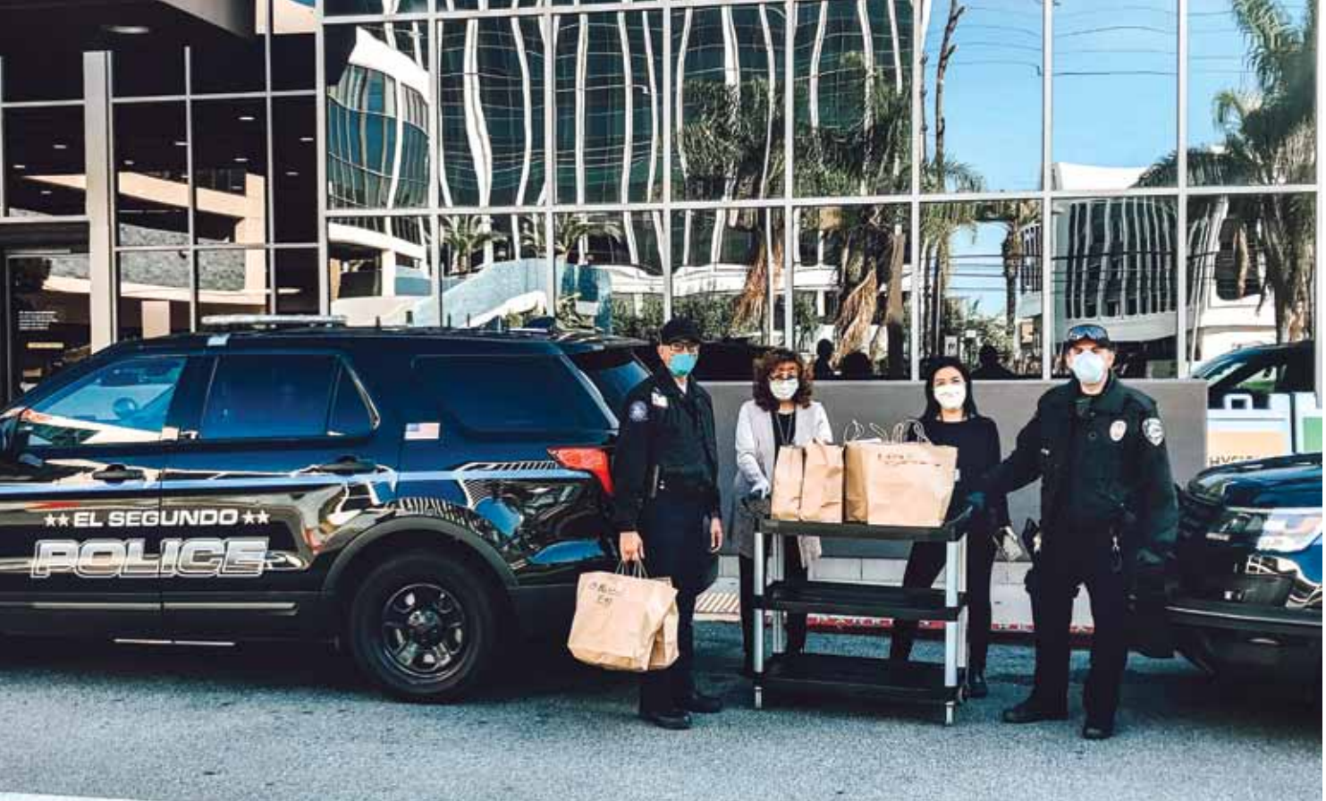
One week ago, Officers McEntyre and Black delivered breakfast sandwiches on behalf of ESPD to the frontline medical staff at Marina Del Rey Hospital. Blue Butterfly worked hand in hand with ESPD to make sure breakfast sandwiches would be ready to pick up and drop off for the medical staff who are working tirelessly around the clock.