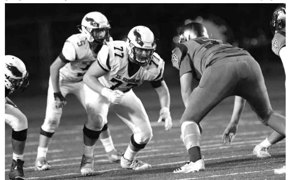
playing football at Occidental College while studying Biologie