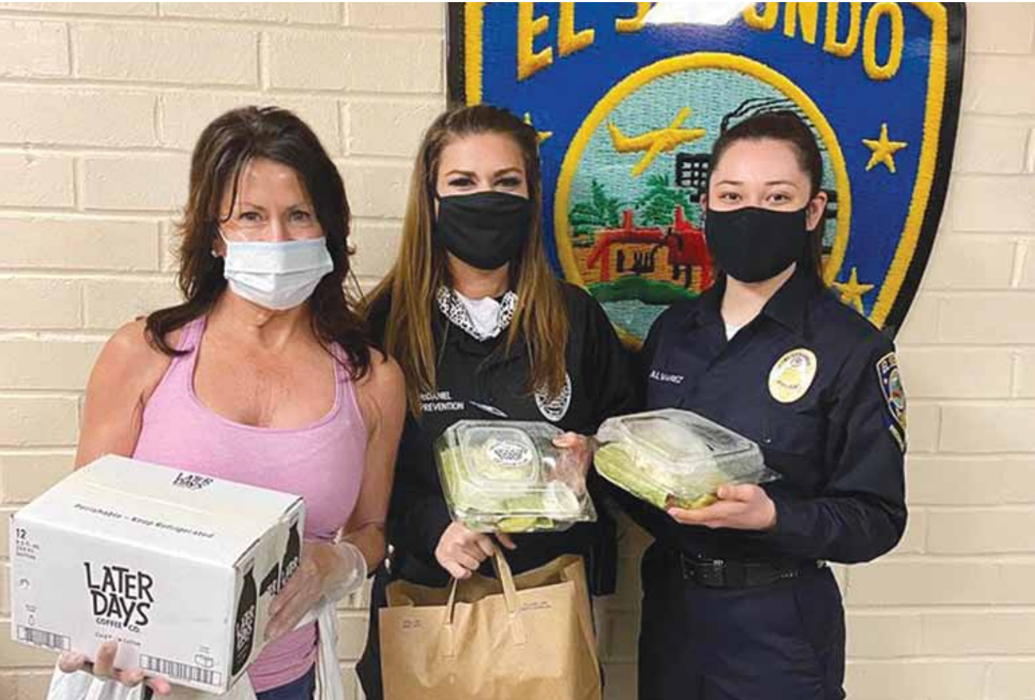
Thank you Good Stuff Restaurant for providing lunch for El Segundo Police Department. As a community, the residents of El Segundo, have come together to support the police, fire and medical staff.