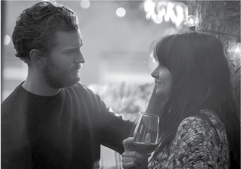
Endings, Beginnings