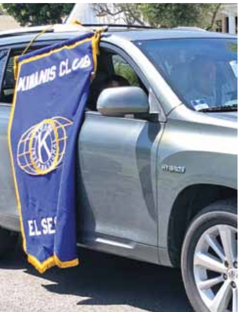
The Kiwanis Club show their support.