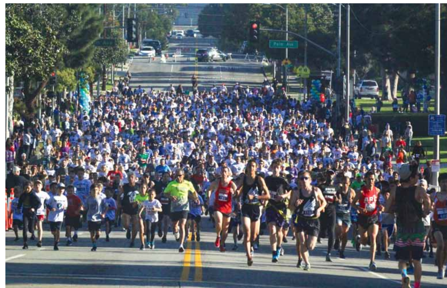
Over 1,600 runners started the 27th annual El Segundo Run For Education 5K/10K last Saturday on Main Street. The annual PTA Council fundraiser benefits local schools. For more Run for Education photos see page 15.