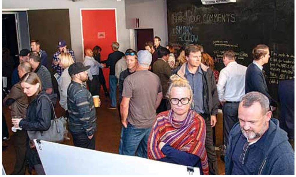
Citizens packed Big Door Studios last Thursday to get a preview of the future of Smoky Hollow during the City of El Segundo's launch event for the district's specific plan update.