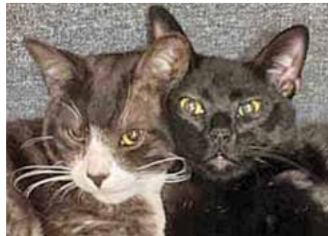
Kirk and Spock

Rescued from a dangerous industrial area, Musya's life was not easy which is another reason why she deserves a loving home. Although she can be shy at first, Musya is a sweetheart once you get to know her! She is an extremely cute girl, petite and loving, with the most gorgeous fur and coloring. Musya enjoys playing and is well-behaved. She is all about belly rubs and loves being brushed. Musya will be a great addition to your furry