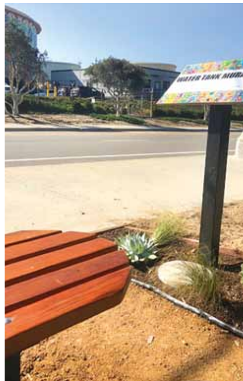
El Segundo TV (Bench and sign)