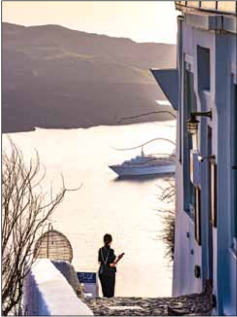
Fira—a girl, a steep mule staircase, and a cruise ship. endured. But as experiences go, our twelve days overflowed with unexpected little bits of serendipity. A few of the stories we lived (and heard) along the way:

Thanks to the superb ships of Blue Star Ferries and the guidance of the iPhone Ferry Hopper App, our voyages caused us far less stress than Odysseus and his crew