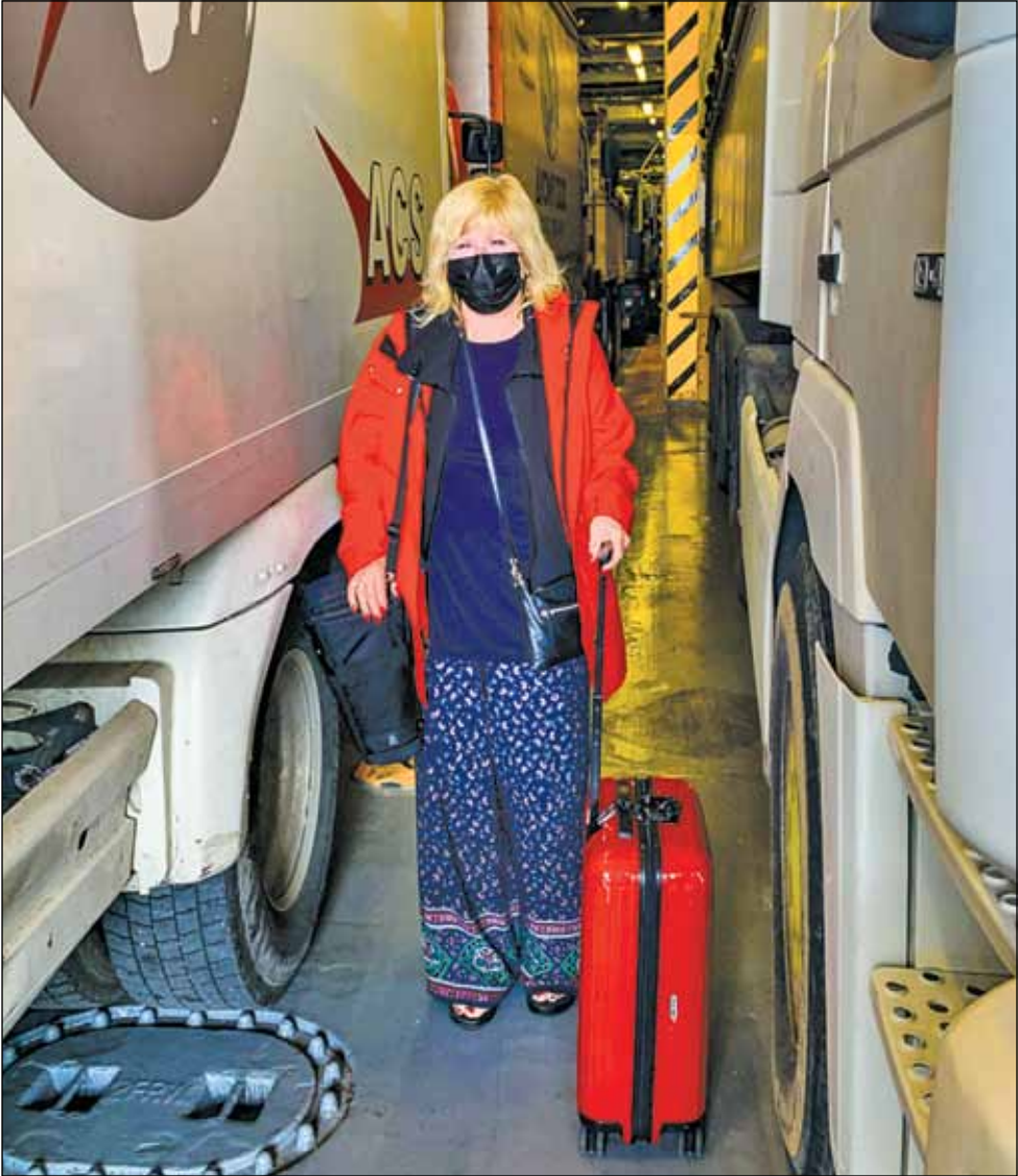
Naxos—ready to race the delivery trucks off the ship.

We usually sail out of Piraeus, the harbor outside of Athens, but you can just as easily ferry out of Patras in Western Greece, Istanbul in Turkey, or Brindisi in Italy. For travelers who like to hyper-organize their trips into check lists of palaces and monuments with the least time wasted in between, this probably isn’t the vacation for you. But if you want to bring down your blood pressure while meandering through 4,000 years of random, serendipitous, occasionally true, but always fascinating history, welcome to the islands. You might just refuse to leave. •