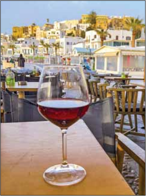
Naxos—a glass of Dionysius’ finest at sunset. and deep-fried anchovies (both headless, thank the gods). We added the classic Greek dip, Tzatziki (sour cream-garlic-herbs-more garlic), and he threw in a thick, native her- ring paste for good measure. We were too early in the season for the local Assyrtiko, a spectacular white wine served young and chilled, but he had a few bottles left over from the prior year. So we spent a couple of hours watching the storms and ferries come and go, until it was our turn to return to Athens and the real world.

Tinos: At 11:30 AM, the local boats hadn’t come in with the daily catch (the “big fish”), so the owner of our favorite tavern, ΑΓΚΥΡΑ, hoped we could make do with tiny grilled pilchard