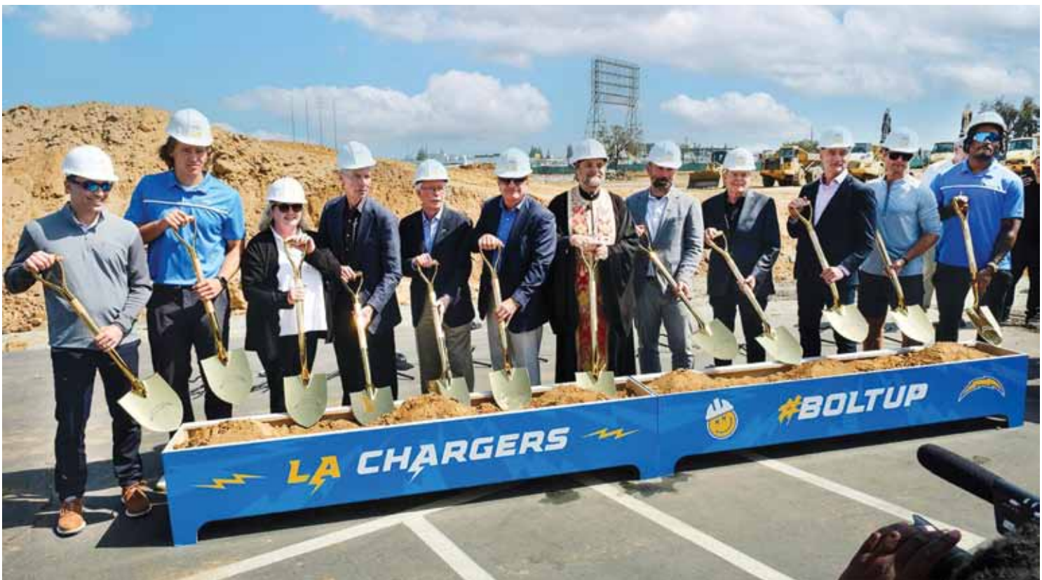
The golden shovels are out at the site that will become the Los Angeles Chargers new headquarters and state-of-the-art training facility in El Segundo. Congrats Chargers. You're in excellent company with other champions including the Los Angeles Lakers, LA Kings and Los Angeles Giltinis. Welcome to the neighborhood.