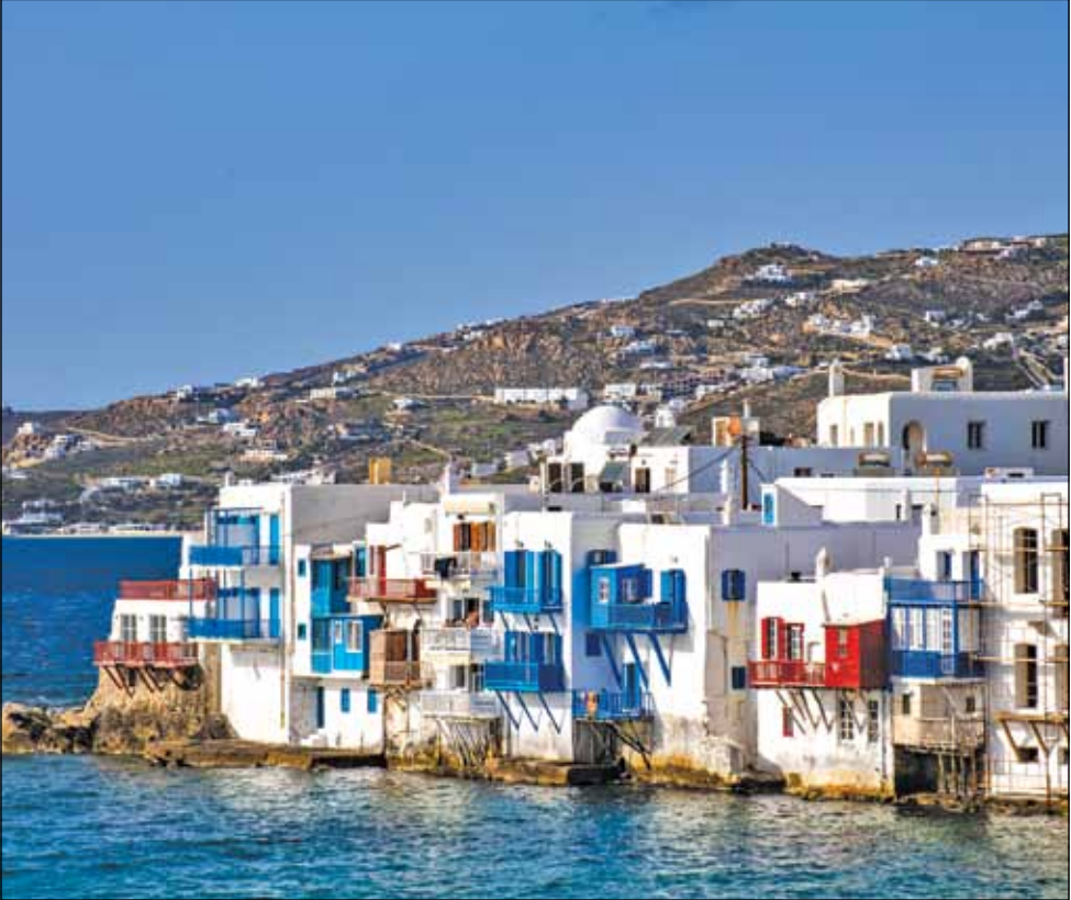
Mykonos—the Little Venice neighborhood left behind by the Italians.