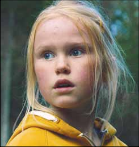
The Innocents