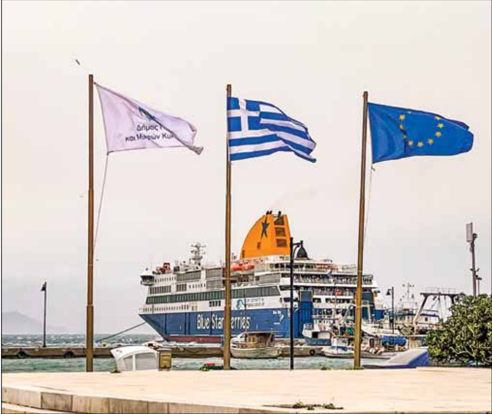
Tinos—your ferry awaits, storm or shine.