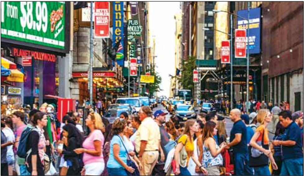
The tourist business is alive and well on Times Square.

up a small stairway into a darkened function room. When we inquired, he reminded us in a thick Russian accent that it was Valentine's Day. When we asked if we could crash his private party, he took $140 from us and told us to show up at 10:30PM. We did, and found that the Russian underworld was alive and well in New York. A fabulous buffet—caviar, blinis, lobster, shrimp, ten kinds of salmon—but the main event was the mobsters in their tuxedos and shoulder bulges and the millions of dollars of bling on their gorgeous, shimmering molls. We were deciding what to drink, when the waiter strode up and dropped off a fifth of vodka and two glasses. Needless to say, we didn't even think about a selfie. The dancing lasted until the sun came up the next morning. •