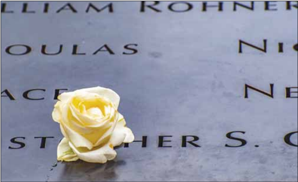
A yellow rose for one of the souls lost at the Twin Towers.

The Plaza: The Oak Room and the Palm Court used to be two of our favorite eateries in town, but then the Plaza lost its way, and the Oak Room