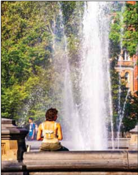
Relaxing with a book in Washington Square.