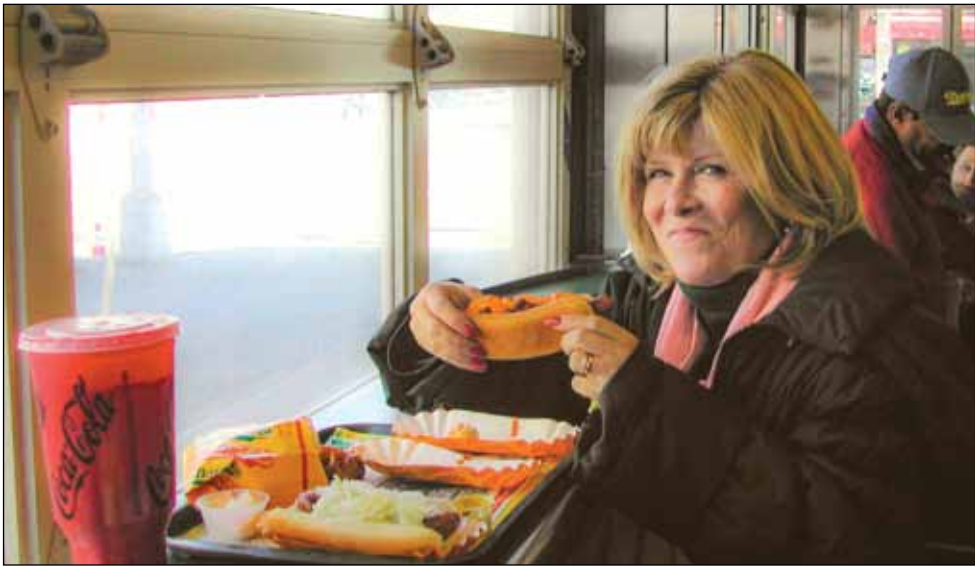
Nathan's Coney Island, home of the International Hot Dog Eating Contest.

TriBeCa: One bitterly cold January evening, we came out of the Tribeca subway into deep snowdrifts and stumbled onto Ideya. This tiny Jamaican treasure had opened just days before, so we snagged a window table to keep tabs on the blizzard over too many of their signature mojitos. Like so many New York gems, Ideya took off like a rocket and then, within a decade, crashed and burned. The point not being to recommend a particular restaurant, but to note how fabulous finds like this come and go all the time. You'll