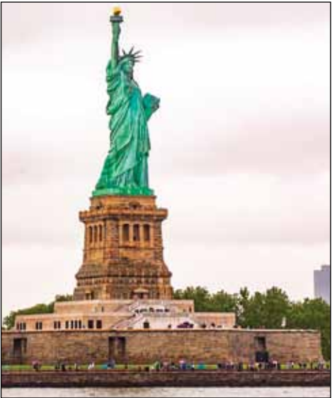
She awaits your tired, your poor, your huddled masses yearning to be free.

Brighton: We turned a corner here one afternoon and came upon a dude unloading crates of vodka