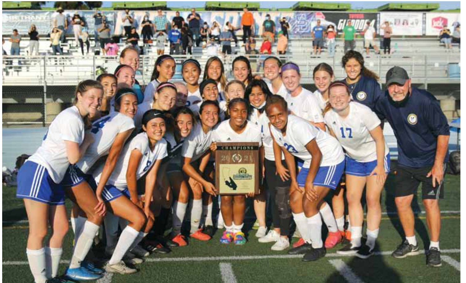
The El Segundo Eagles pose with their CIF Southern Section championship plaque after defeating San Dimas 2-1. For story see Sports on page 3.