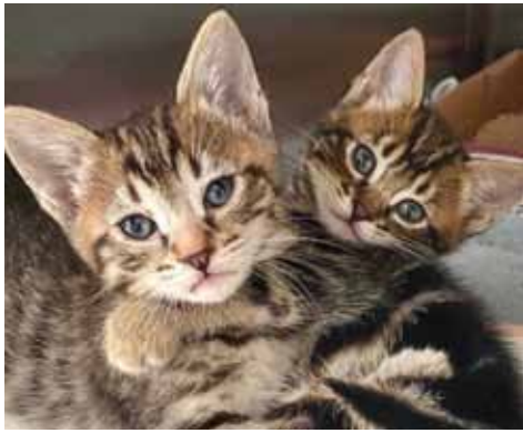
Mac and Cheese

Did you miss National Pet Adoption Day? No worries...we have plenty of kitties who are waiting to be your purr-fect match.