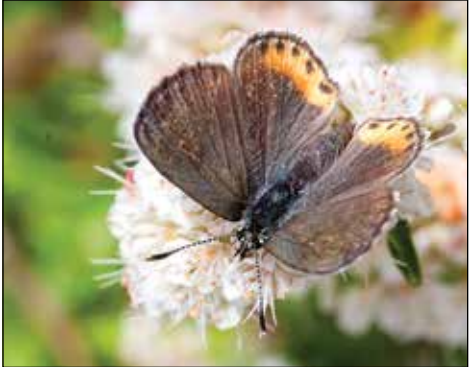
Female El Segundo Blue Butterfly.