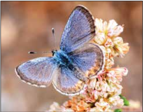
Male El Segundo Blue Butterfly.

El Segundo-based photographer and painter Sarah Ainsworth specializes in nature and conservation photography, with a deep focus on the local environment. Since 2023, she has worked with the El Segundo Blue Butterfly Conservancy to document the endangered El Segundo Blue butterfly and conservation efforts to protect its fragile habitat. Whether photographing coastal scenes, the majesty of our public lands, or the beauty of her garden's blooms, her award-winning work reflects a lifelong passion for connecting with and protecting the natural world. Her images invite viewers to connect with the wild beauty that we often overlook in our busy lives. Her work has been featured in local press, on the city's new "Welcome to El Segundo" sign, and commercially. You can learn more about Sarah and her work on her