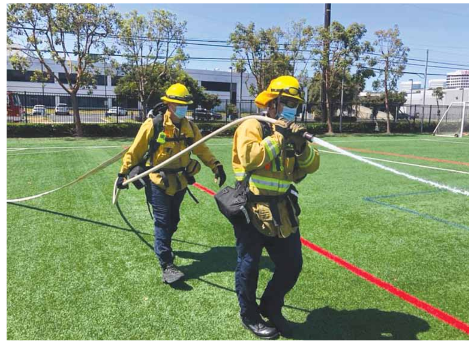
The El Segundo Fire Department continues to train throughout this pandemic while staying safe and responsible. Wildland Fire season is here and all three shifts are brushing up on their hose lays and fire shelter deployments.