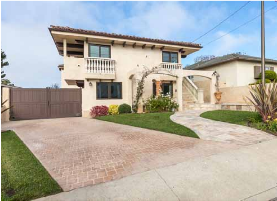
639 W. OAK AVENUE $4,295,000 5 Bedrooms | 5 Baths | 4,166 Sqft

#1 AGENT IN EL SEGUNDO | #2 RE/MAX AGENT IN THE NATION | #3 RE/MAX AGENT WORLDWIDE