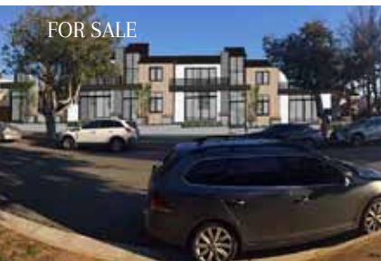
FOR SALE 1802 DELAWARE AVENUE

$10,400,000 12,328 sqft 20,504 sqft lot Outstanding commercial property on a prime corner location with phenomenal visibility and ample parking. Excellent Owner User or Investment Opportunity