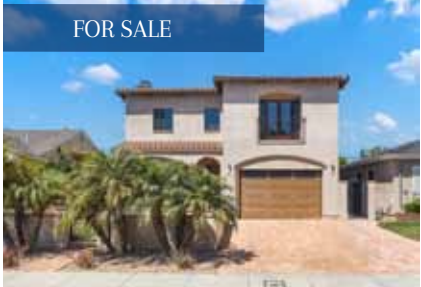
FOR SALE 7947 STEWART AVENUE WESTCHESTER, CA, 90045 5 Bedrooms | 5 Baths | 3,825 Sqft $3,300,000

First time on the market in over 60 years! A classic 1920’s home is simply full of charm and character. This house is situated on an incredible 7,000 square foot corner lot that offers a cabin feeling with its roomy front porch and a beautiful pine tree on its large front yard, thus adding to its great curb appeal.