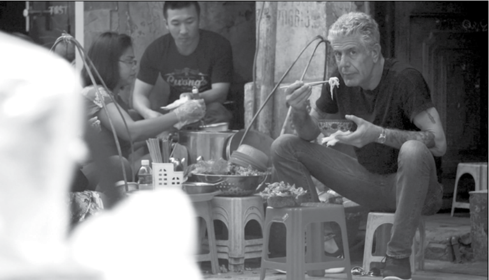
Photo Courtesy: Anthony Bourdain in 'Roadrunner,' a film by Morgan Neville.

Morgan Neville is the perfect person to capture this complicated figure, flaws and all.