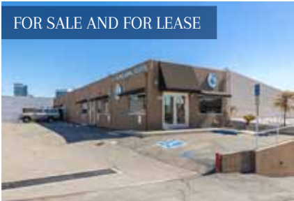
FOR SALE AND FOR LEASE 240 CENTER STREET

Incredible, custom built, Mediterranean-style home in the highly desirable neighborhood of North Kentwood is a home you will fall in love with. The front patio welcomes you to this remarkable 2-story home that is filled with natural light as a result of expanse windows, glass doors, skylight above the open stairway, and high ceilings.