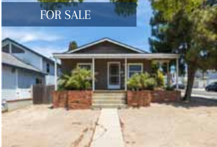
FOR SALE 602 ARENA STREET EL SEGUNDO, CA, 90245 3 Bedrooms | 1 Baths | 1,248 Sqft $1,598,000

This spectacular El Segundo fully remodeled Tuscan home is an entertainer’s dream! From its elegant facade to the lushly landscaped front yard & backyard, this home is remarkable from every angle. It has an open floor plan, consists of 5 Beds/5 Baths, ocean views, vaulted ceilings, engineered wood flooring, recessed lighting, natural stone flooring, large Pella vinyl lifetime windows, richly crafted finishes & high-end upgrades throughout. The grand entrance meets the foyer to the dining area and opens to the stylish chef’s kitchen, flooded with natural light. Top-of-the-line Miele kitchen appliances, pot filler faucet above the 8-burner stove, two ovens, built-in automatic coffee maker, a prep sink, custom white cabinets, extra-large island with granite countertops, and a white backsplash