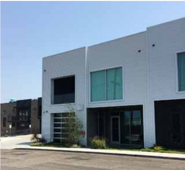
Virtularium Gallery (130 Penn) will be a main venue featuring 7 artists, DJ and a beer + wine bar.