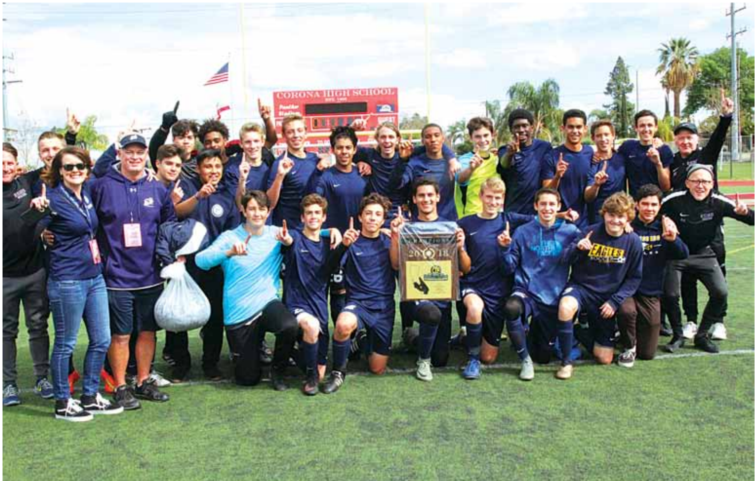
Eagle soccer team poses after their 2-0 win over Hesperia in the CIF championship final game. For story see page 8.