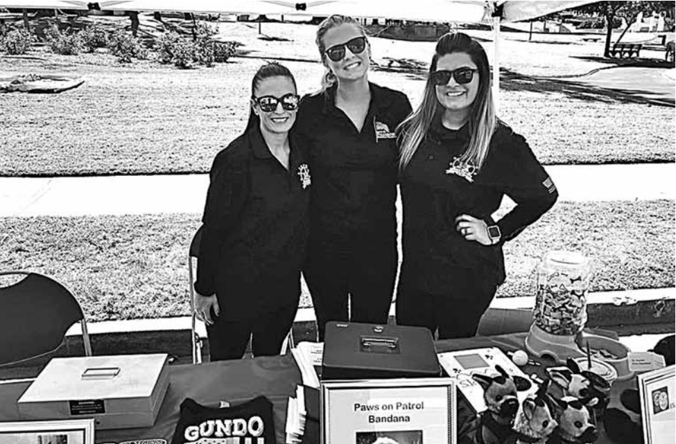
On Tuesday, Aug. 7 from 5 to 8 p.m., the community came out to Library Park for National Night Out, hosted by ESPD. The festivities included Dunk-A-Cop, a Beatles tribute band, face painting, kid-print, defensive tactics instructions, train rides, obstacle course, bounce houses, photos with McGruff, giveaways and more. The photo above was taken at the K9 and Pink Patch booth. Photo/Content: ESPD