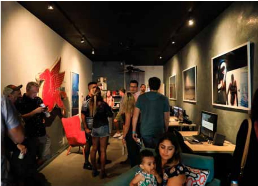
Kill2Birds on Main Street will be displaying photography from Tom Bik.