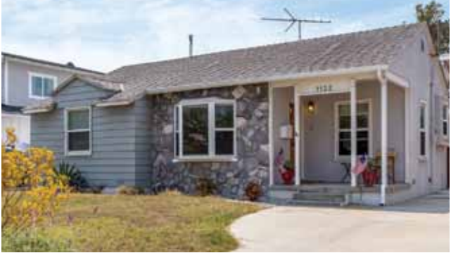
1122 E. ACACIA AVE 3 BEDS • 2 BATHS • 1,265 SF • UPDATED KITCHEN & BATHS • DETACHED TWO CAR GARAGE