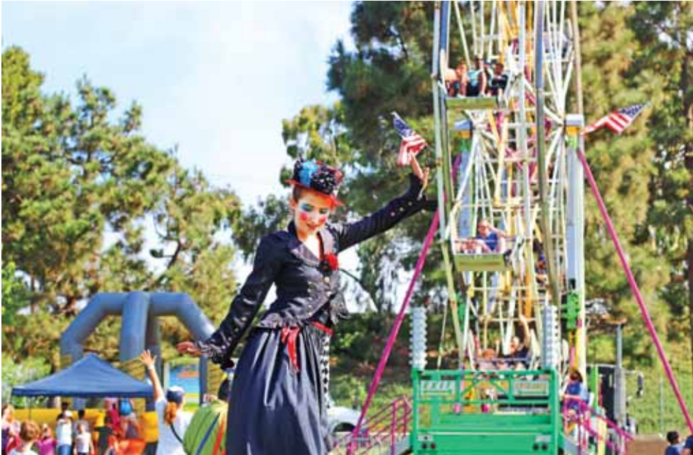
An impressive stand-up routine in front of the Ferris Wheel at Chevron Park.

other entertainment. Here are some of the photo highlights. •