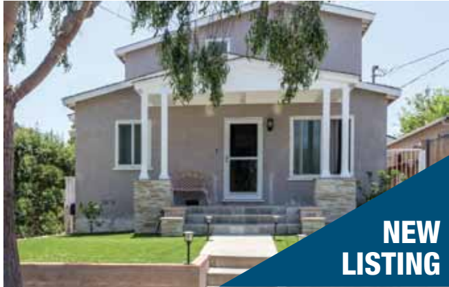
126 W. OAK AVE [2 UNITS] FRONT UNIT: 4 BEDS/2 BATHS • UPGRADED KITCHEN WITH STAINLESS STEEL APPLIANCES BACK UNIT: 2 BEDS/2 BATHS