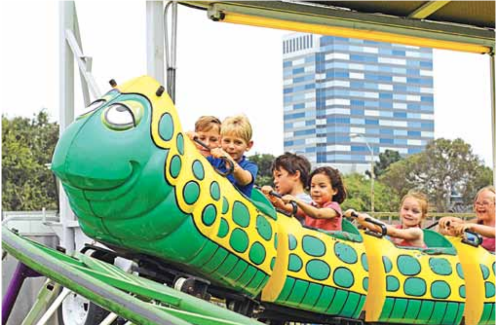
The Caterpillar was one of the most popular rides at the Centennial Carnival.