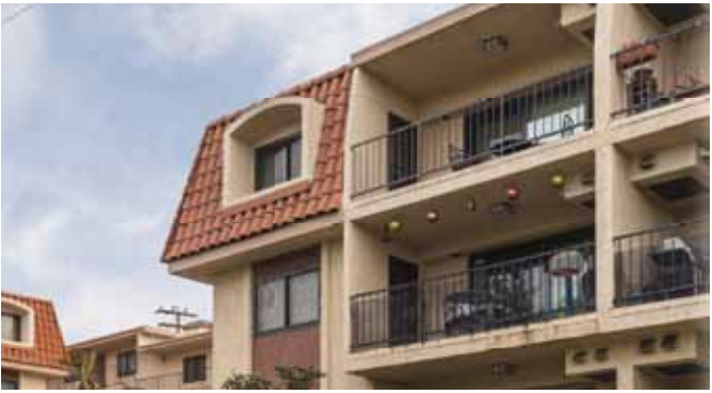
900 CEDAR ST #205 2 BEDS • 2 BATHS • POOL • SPA COMPLETELY REMODELED! REC-ROOM • $579,000