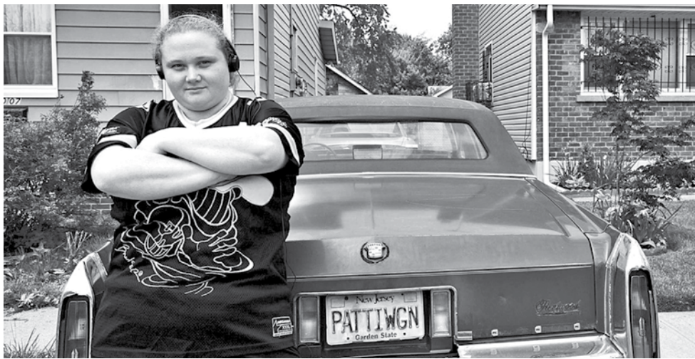
Danielle Macdonald in Patti Cake$.

Patti Cake$ is rated R for language throughout, crude sexual references, some drug use and a brief nude image. 108 min. Now playing at select ArcLight theaters. •