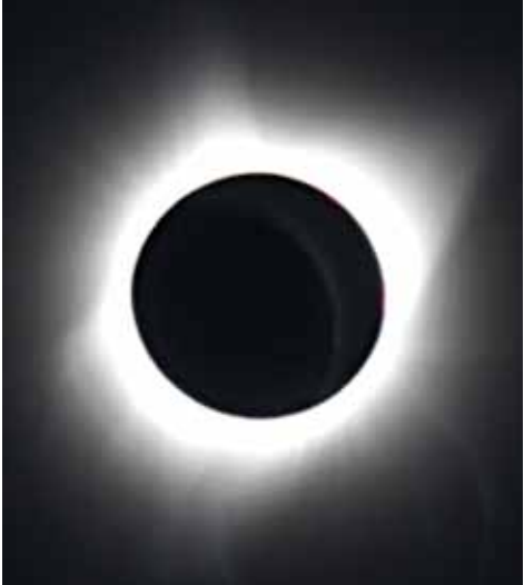
Totality of the sun is being blocked by the moon.