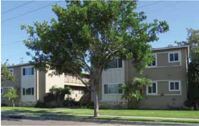
TWO SIDE BY SIDE 6 UNIT BUILDINGS EACH BUILDING HAS TWO 2 BED • 2 BATH UNITS AND FOUR 1 BED • 1 BATH UNITS