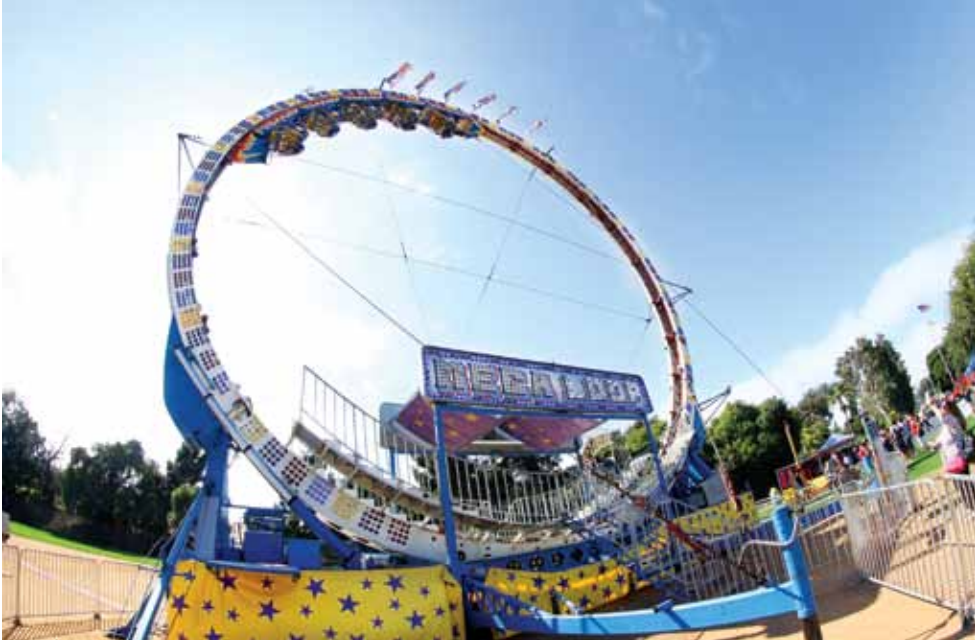
There's no view like upside down on the Mega Loop!