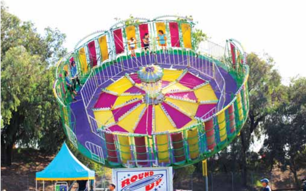
A few brave riders taking a spin on the Round Up.