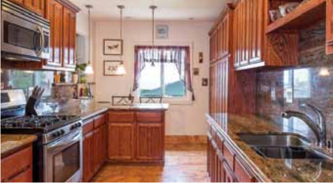
754 HILLCREST ST 4 BEDS • 3 BATHS • 2,243 SF REMODELED KITCHEN • $1,488,000