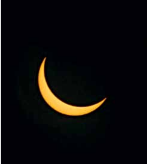
The moon is crossing over in front of the sun, creating a crescent sun.