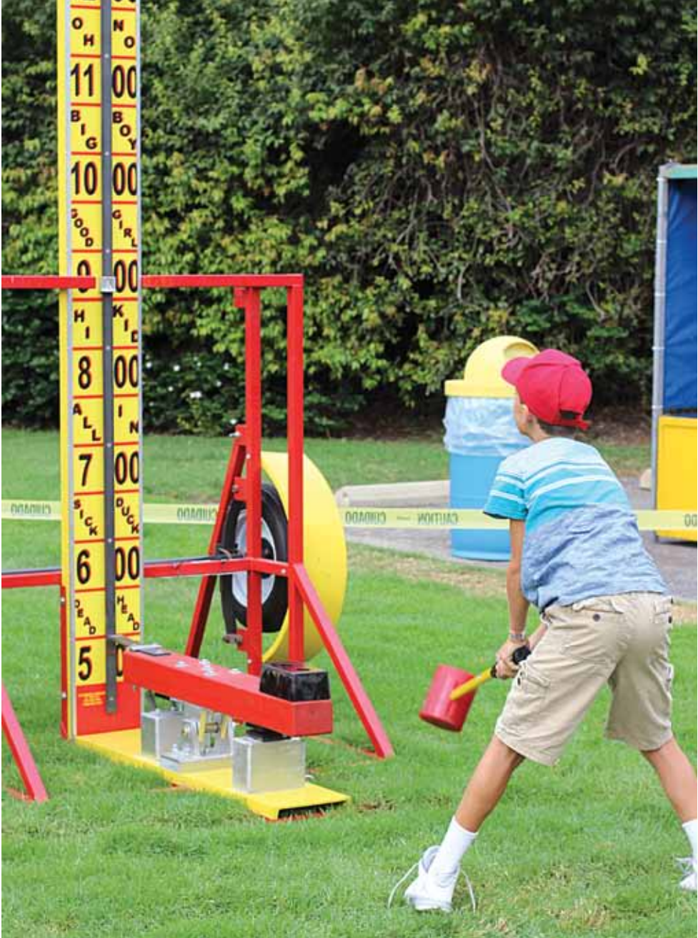
This young man gets ready to show off his strength.