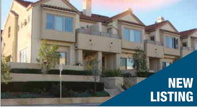
303 KANSAS ST #B HUGE! • 3 BEDS+DEN • 2 ½ BATHS • OVER 2,000 SF