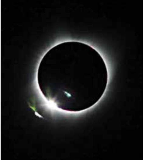
Baily's beads, or Diamond ring effect.

Texas to Maine. We flew to Medford, Oregon and rented a car the day before the big event. Since motels were sold out starting at $399 a night at Motel 6, we planned on car-camping in Madras, Oregon. Madras was one of the best places to view the eclipse in the nation. A friend See Solar Eclipse, page 6