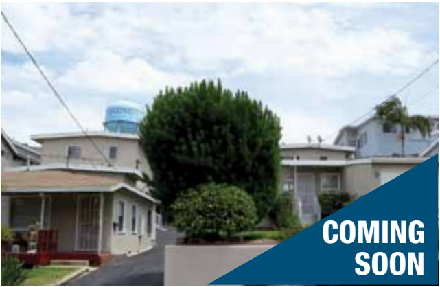
326-330 SIERRA ST 10 UNITS [4 UNITS + 6 UNITS] SOLD TOGETHER 2 [2 BED/1 BATH HOUSES] • 7 [1 BED/1 BATH UNITS] 1 SINGLE UNIT • $4,100,000