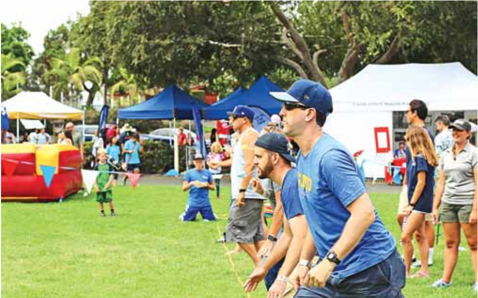
Community members prepare to start the Egg on Spoon.