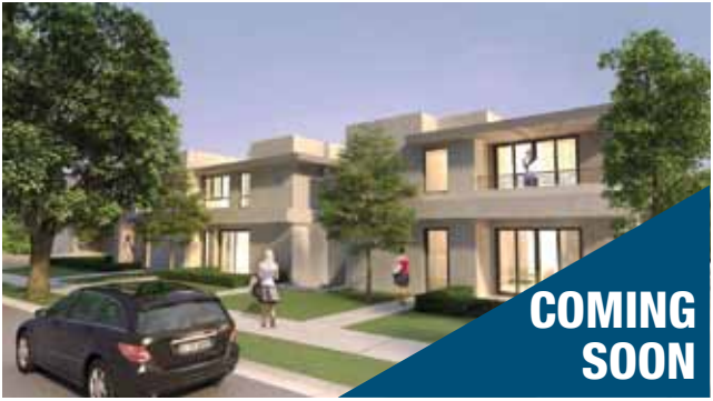
NEW TOWNHOMES 3 & 4 BEDS SOME UNITS WITH ROOF TOP DECKS