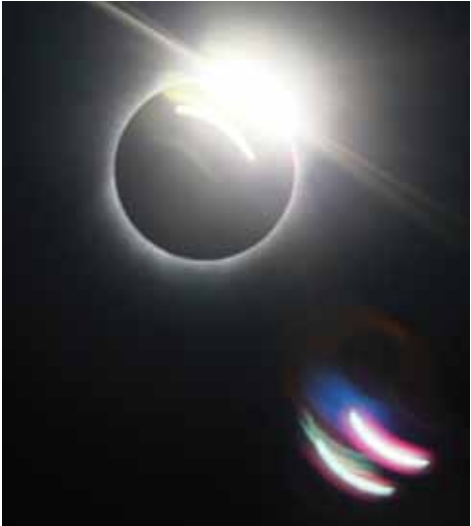
Baily's beads, or Diamond ring effect.