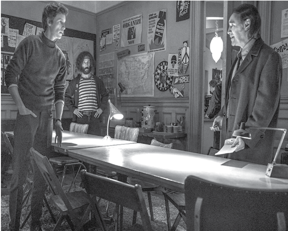
The Trial Of The Chicago 7 , courtesy of Netflix.

Sorkin said it himself at the drive-in screening I attended at the Rose Bowl: “This film will upset you. Anger you. But above all else, it will inspire you.” It’s no coincidence