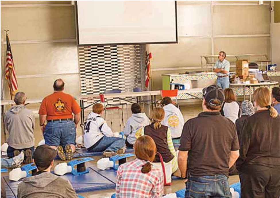
El Segundo CPR Saturday class begins.