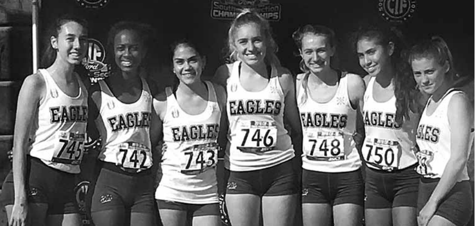
The Lady Eagles placed third at the Cross Country CIF Finals.