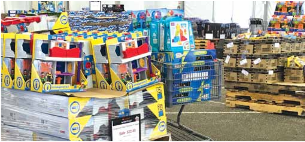
Toys, games and dolls in the holiday tent.