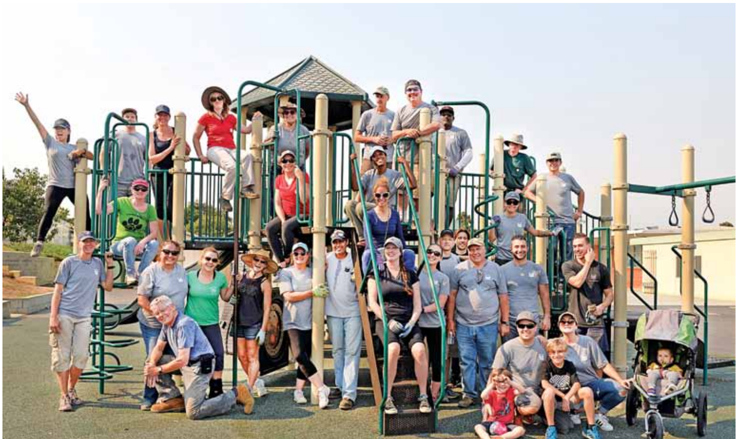
Chevron employees joined parents and administrators in building twenty-two raised durable green beds for ADA accessible school garden at Center Street School. Materials to build the boxes were donated by Chevron.