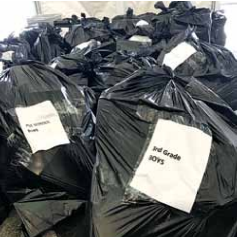
Bags of toys headed to charities.