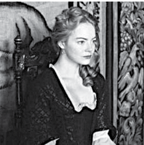
The Favourite

Jockeying for power meets madcap mayhem in visionary Yorgos Lanthimos's latest absurdist-comedy, The Favourite . The art house connoisseur keeps to his infamous theme of unconventional relationships in this pseudo-period piece that is deliberately and deliciously perverse. Focusing on the behind-the-scenes politicking during the reign of Queen Anne in 18th century England, the possibility of war with France puts the entire country on edge. But that threat doesn't compare to the drama born inside the royal castle walls between two cousins vying to win the Queen's affection. With