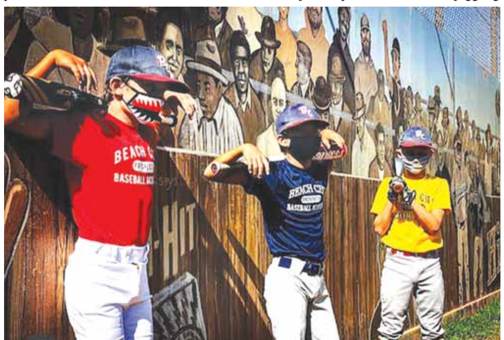
Students wear masks during instruction

"I hope they take away a sense of belonging, a sense of being a part of a team, and that maybe are inspired to step up and lead as they grow." When not impacted by a virus, Beach City also offers a free special needs training program, as well as an international tournament hosting a little league team from Japan. •