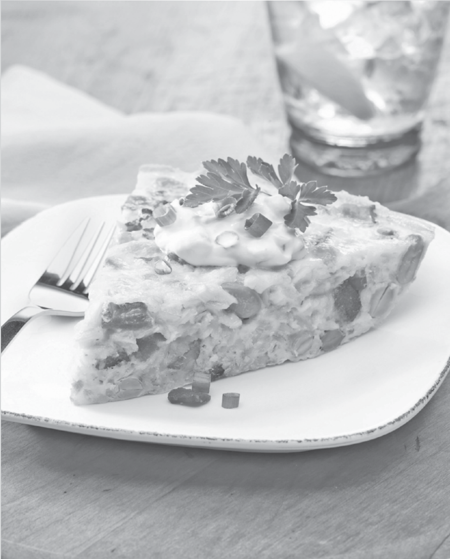
Makes 6-8 servings