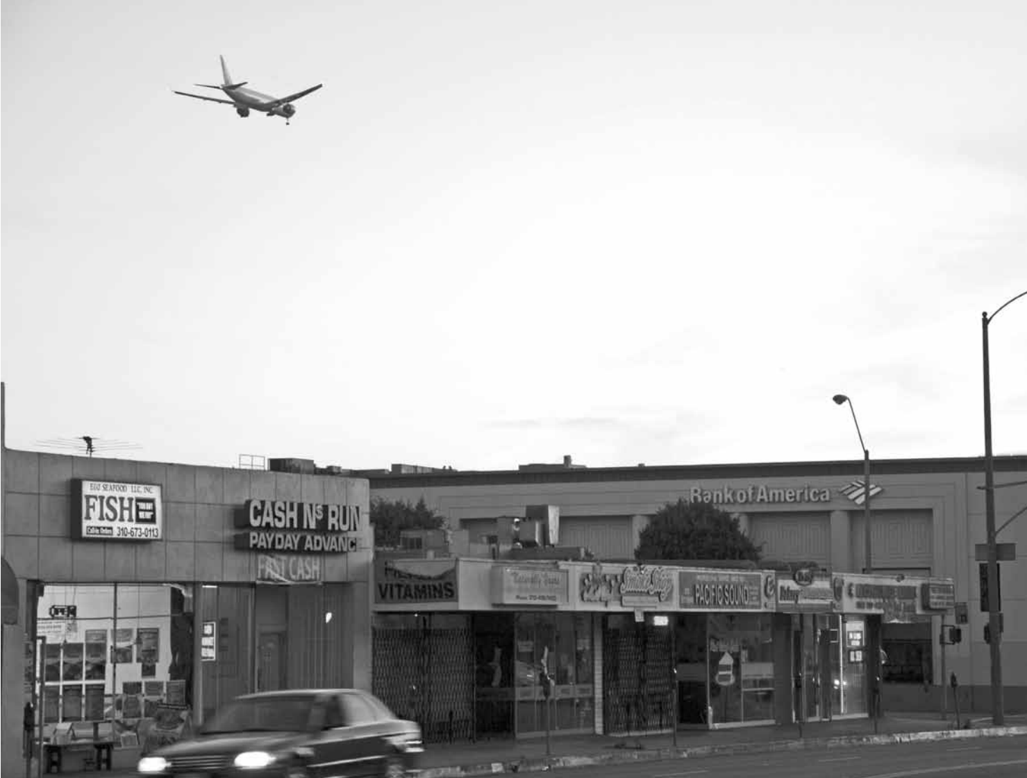
Evening falls over the 400 East block of Manchester Boulevard.