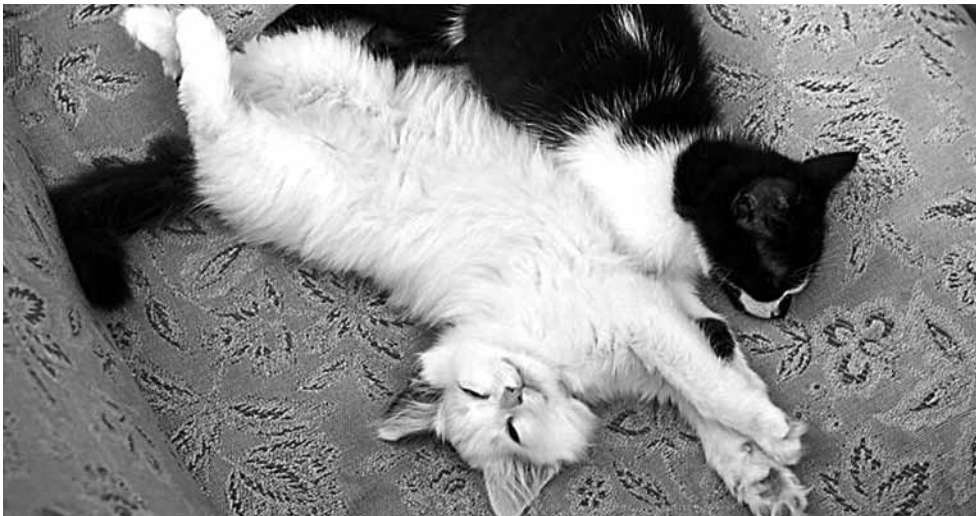
Snowflake and Winter

Saving one animal won't change the world, but the world will surely change for that animal. •