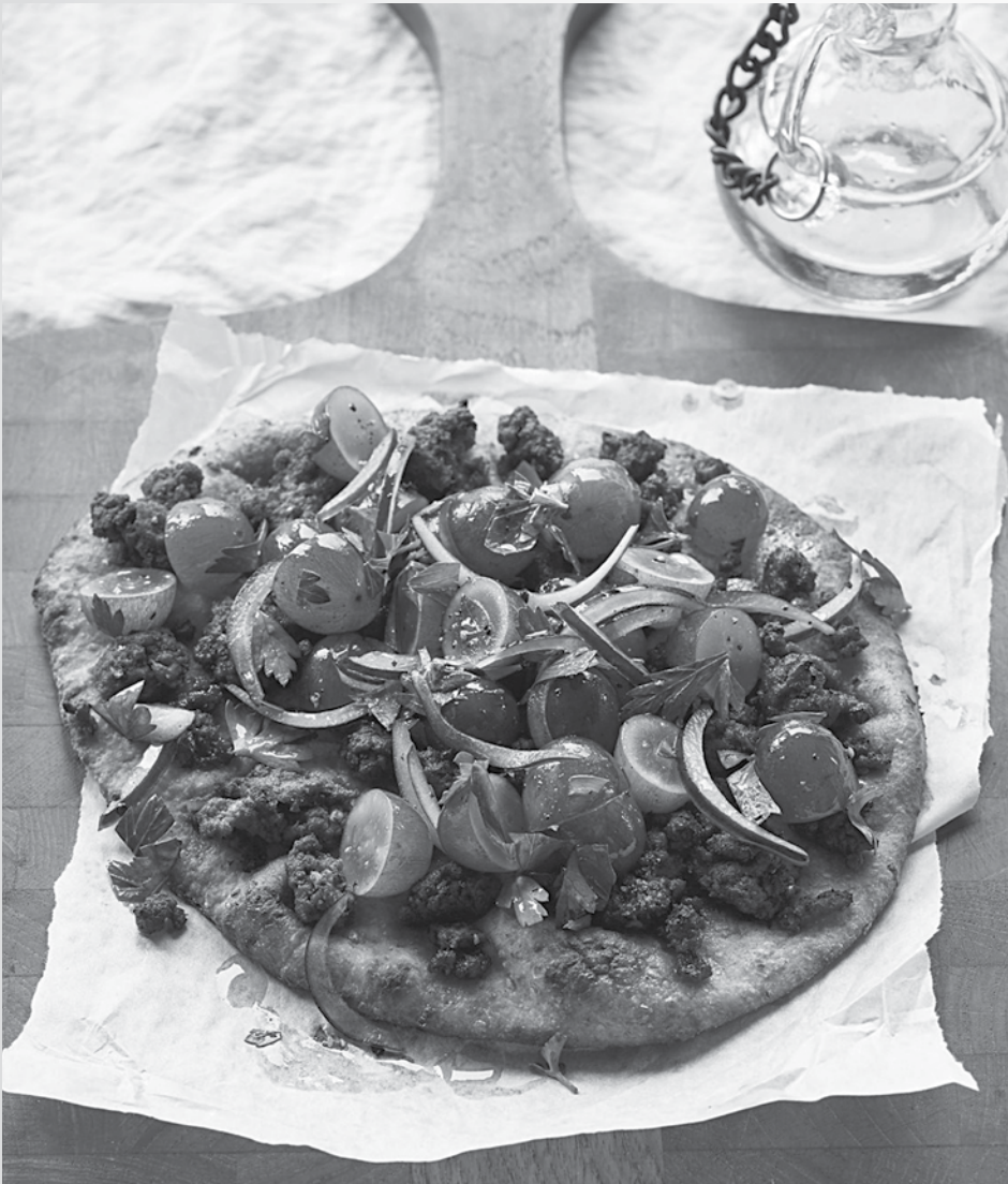
Recipe provided by Brandpoint.

Prep Time: 15 Minutes • Cook Time: 15 Minutes • Yield: Serves 4