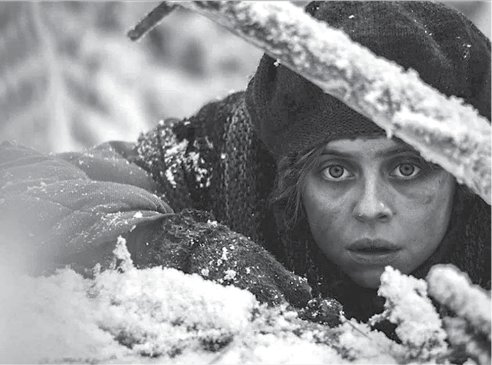
Ashes in the Snow

much of the film’s electric tension. Nikolai confides to Elena that he shares her feelings of frustration about the position in which he has been put. However, their shared feelings toward their mutual circumstances aren’t enough to form any sort of bond between them. The two develop a dysfunctional relationship that stands in complete contrast to the evolving relationship Lina finds herself in with a fellow prisoner, Andrius (Jonah Hauer-King). A slight nod to the Shakespearean dilemma of two lovers being torn apart by their surroundings, their optimism is a much-needed signal of strength.