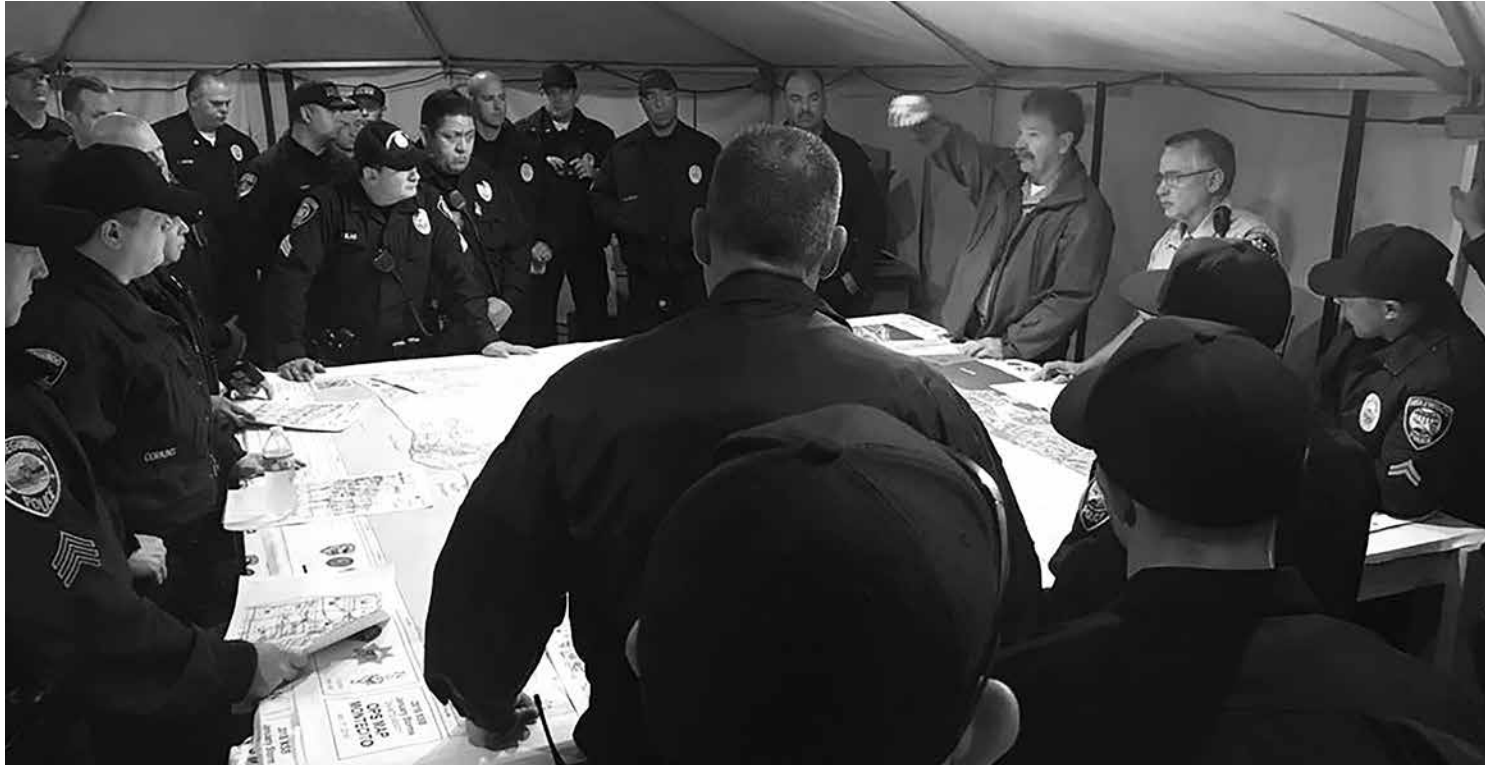
As part of a mutual aid response team, Inglewood Police Officers provided support to the Santa Barbara County Sheriff's Office in response to the mud slides in Montecito.